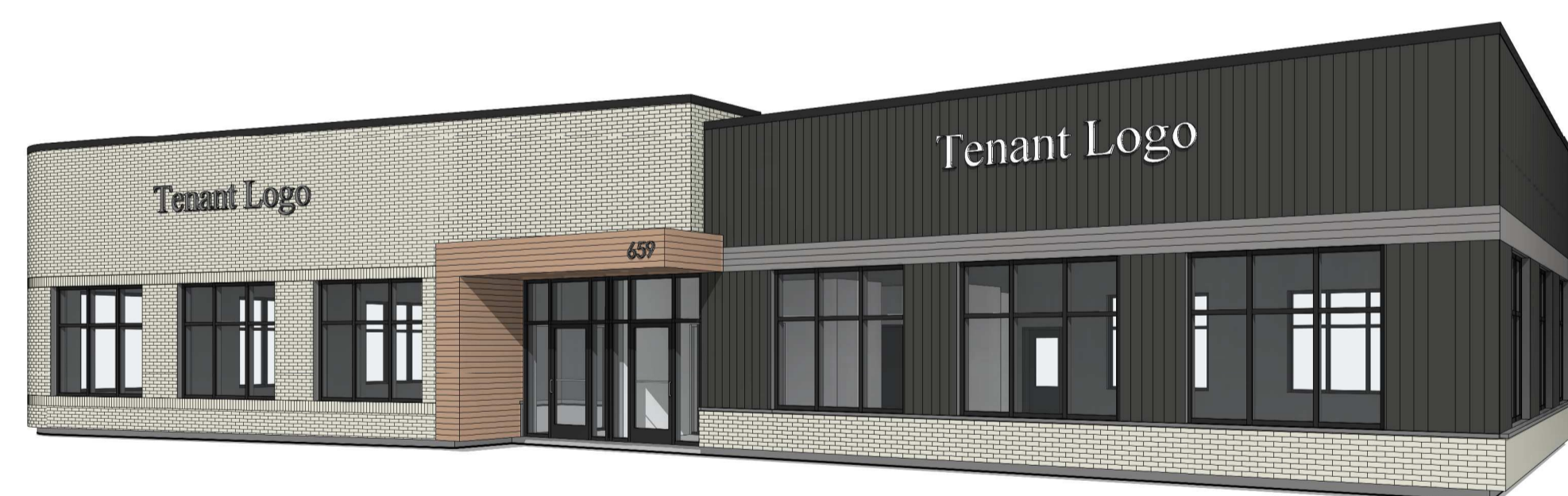
5 PERSPECTIVE A4.00

TOTAL EXTERIOR WALL AREA: 5,330 SF (495.2 m 2 ) TOTAL GLAZING AREA: 1,181 SF (109.7 m 2 ) [22.1%]