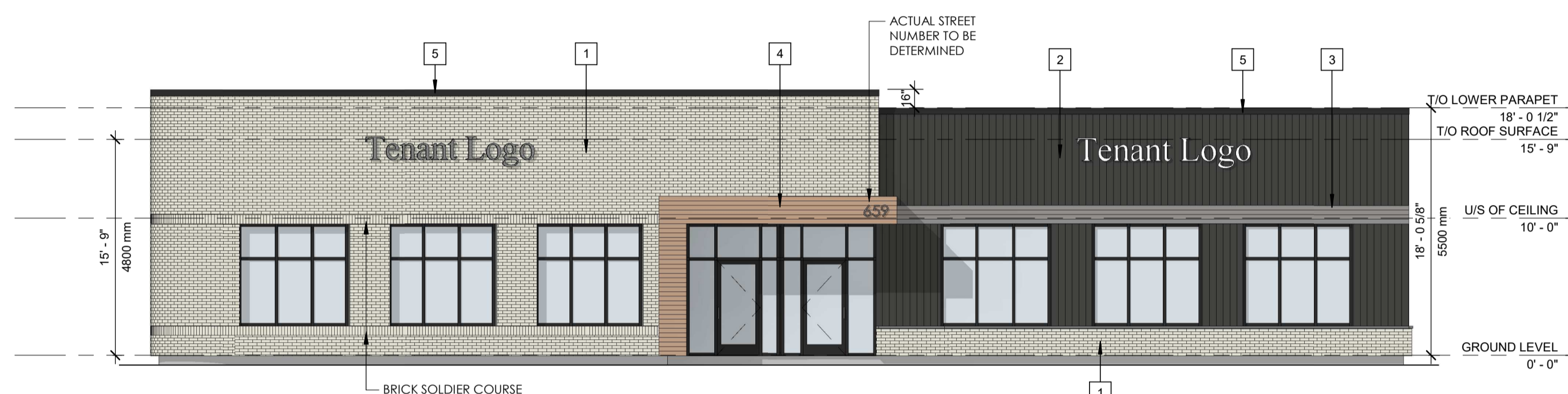
2 WEST DESIGN ELEVATION A4.00 1/8" = 1'-0"

EXPOSING BUILDING FACE: 1,094 SF (101.6 m 2 ) GLAZING AREA: 243 SF (22.6 m 2 ) [22.2%] UNPROTECTED OPENING %: 22.2% LIMITING DISTANCE: 24'-11" (7.6 m)