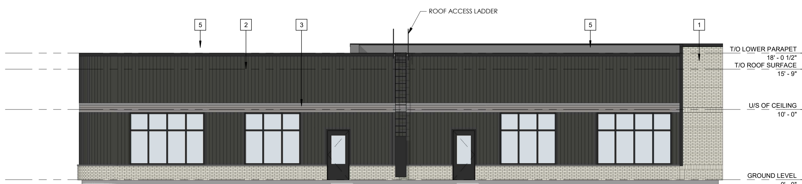
4 EAST DESIGN ELEVATION A4.00 1/8" = 1'-0"

EXPOSING BUILDING FACE: 800 SF (74.3 m 2 ) GLAZING AREA: 180 SF (16.7 m 2 ) [22.5%] UNPROTECTED OPENING %: 22.5% LIMITING DISTANCE: 69'-3" (21.1 m)