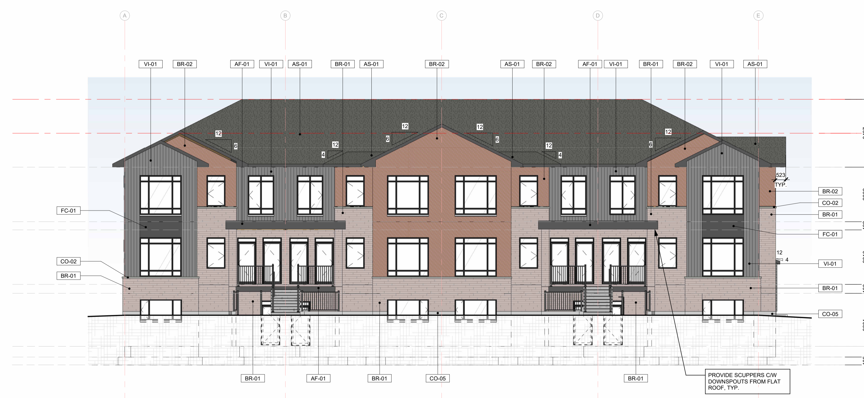
1 FRONT ELEVATION A202 1:100