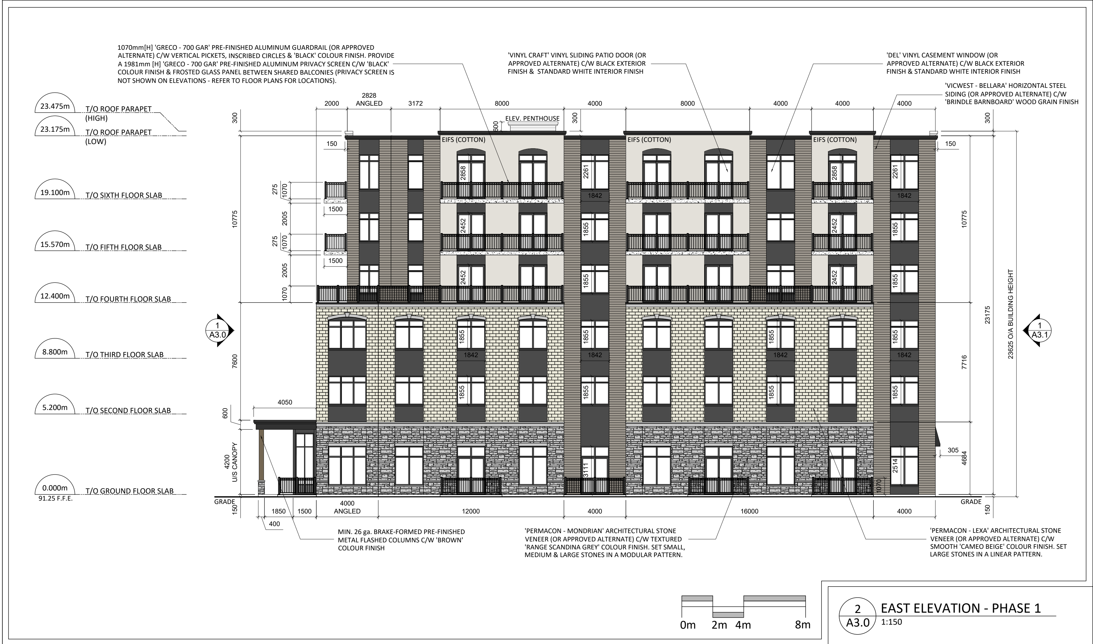
2 EAST ELEVATION - PHASE 1 A3.0 1:150