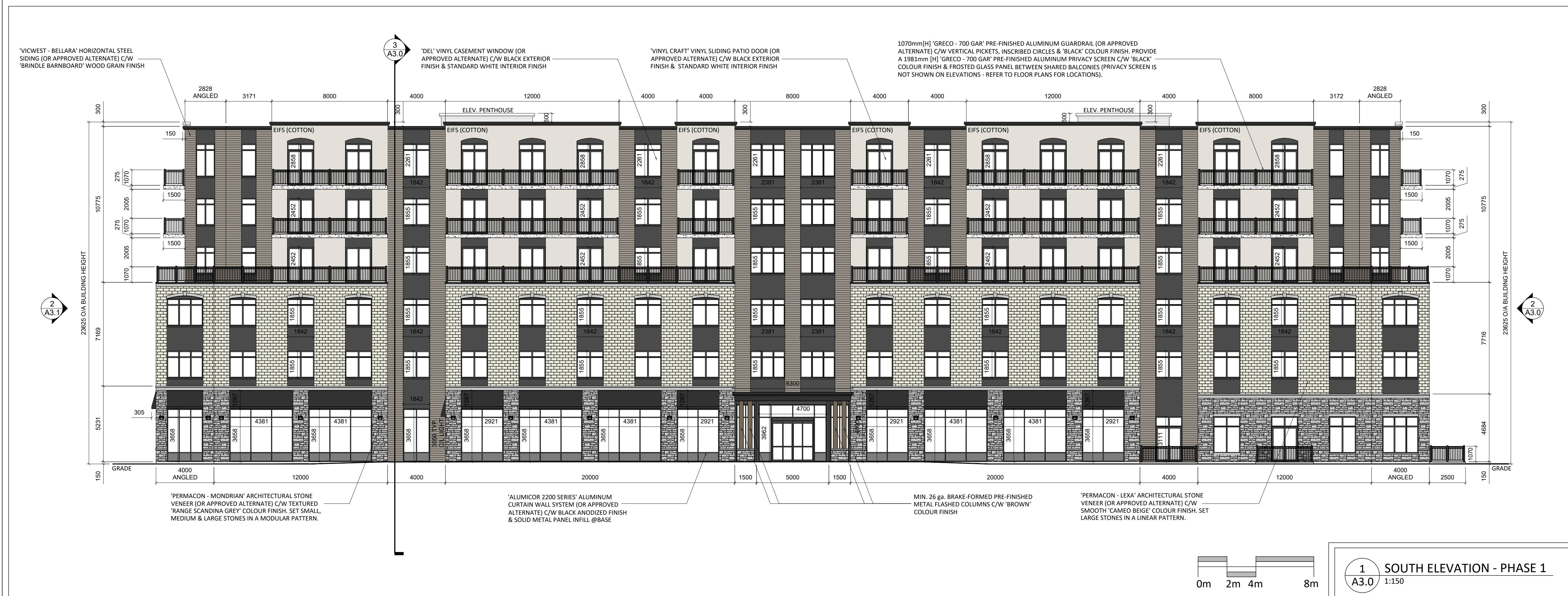
1 SOUTH ELEVATION - PHASE 1 A3.0 1:150