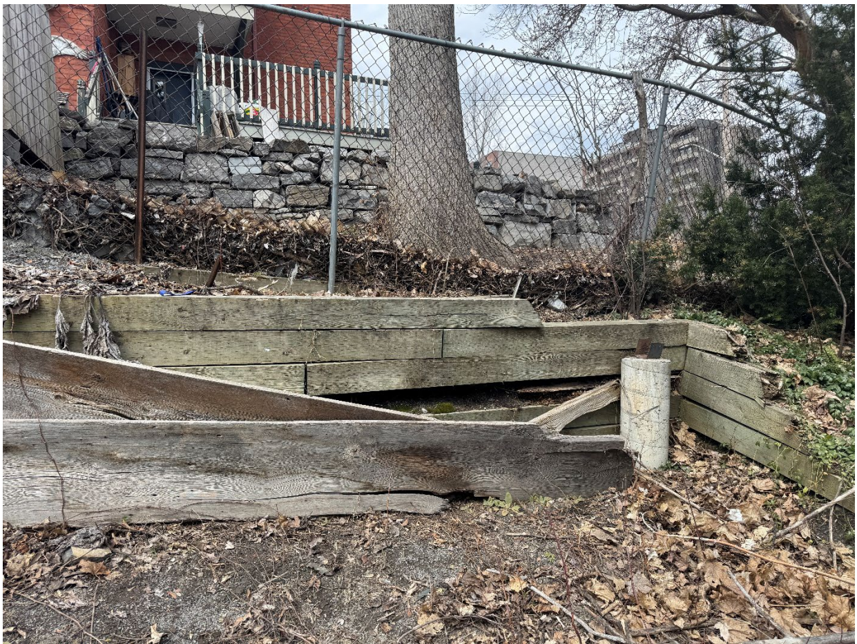
Photo 1: Existing retaining wall by Tree 10, American elm on adjacent property. The new retaining wall will be over 4 m in depth