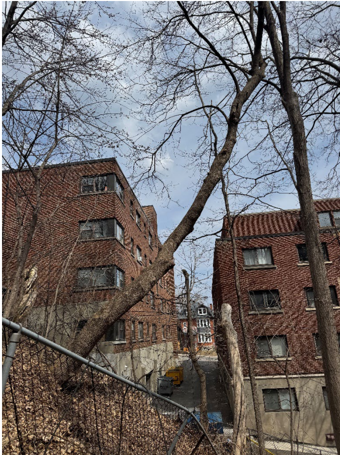
Photo 3: Tree 27, Manitoba maple on adjacent property that should be removed due to the potential for failure on subject property

If the adjacent property owner does not support removal of this tree, an option would be to remove the portion of the tree extending over the subject property line to reduce the weight and reassess. Although this may not be an accepted arboricultural practice, it may reduce the risk to an acceptable level which is a higher priority. It is recommended that a risk assessment be completed after the pruning has been completed.