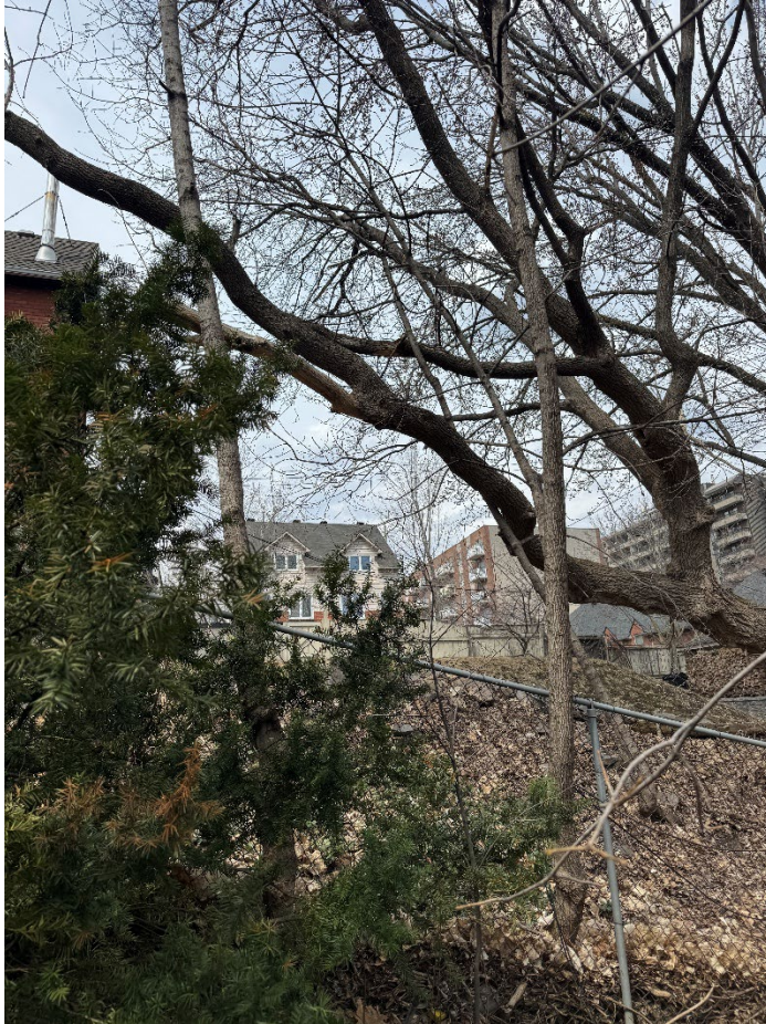
Photo 4: Small Manitoba maples along the fence line, intertwined with the fence

Additional two small Manitoba maple along the fence line: There are two small Manitoba maple along the fence line, intertwined with the existing metal fence, that will also require removal. These trees measure 11 cm in diameter and are in poor health due to their weak bases.