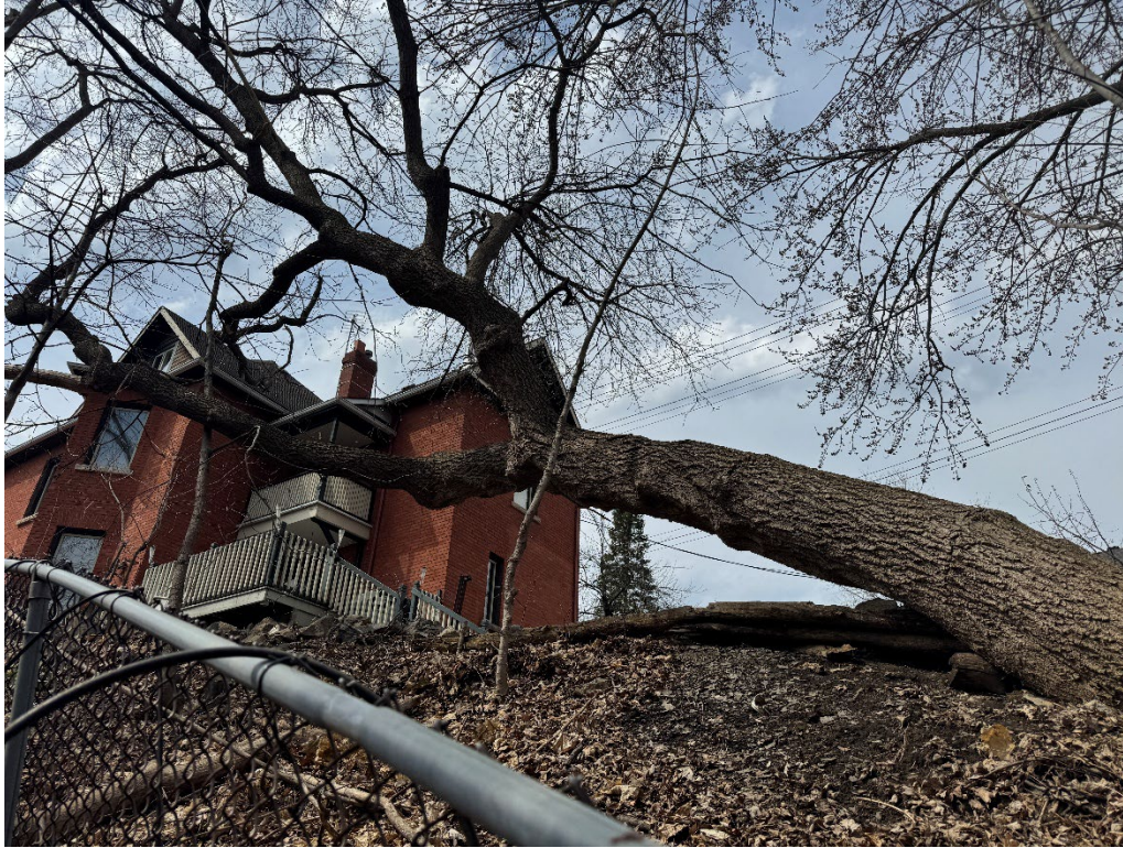
Photo 2: Tree 11, Manitoba maple with very heavy lean on adjacent property

Tree 11: This tree is located on the adjacent property and exhibits a severe structural defect, growing at a nearly horizontal lean. Given its poor condition, the tree may be susceptible to failure triggered by construction-related vibrations. While its removal is not mandatory for the project, it is recommended that the applicant consult with the neighbor to explore this option. At a minimum, any large branches encroaching over the subject property that pose a risk of failure should be pruned.