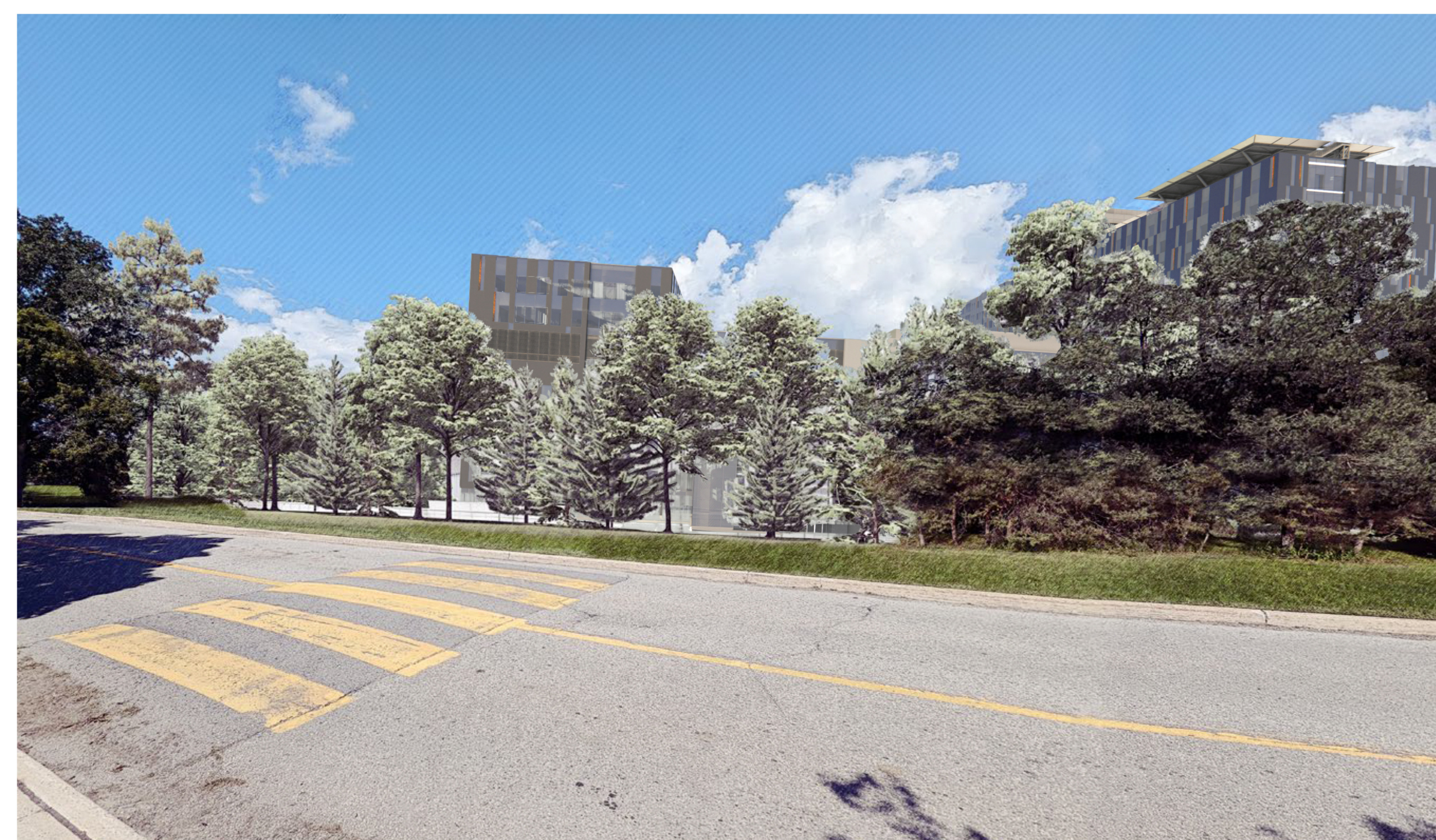
Views Analysis - Referenced Views #9 View from Maple Drive North toward the Hospital