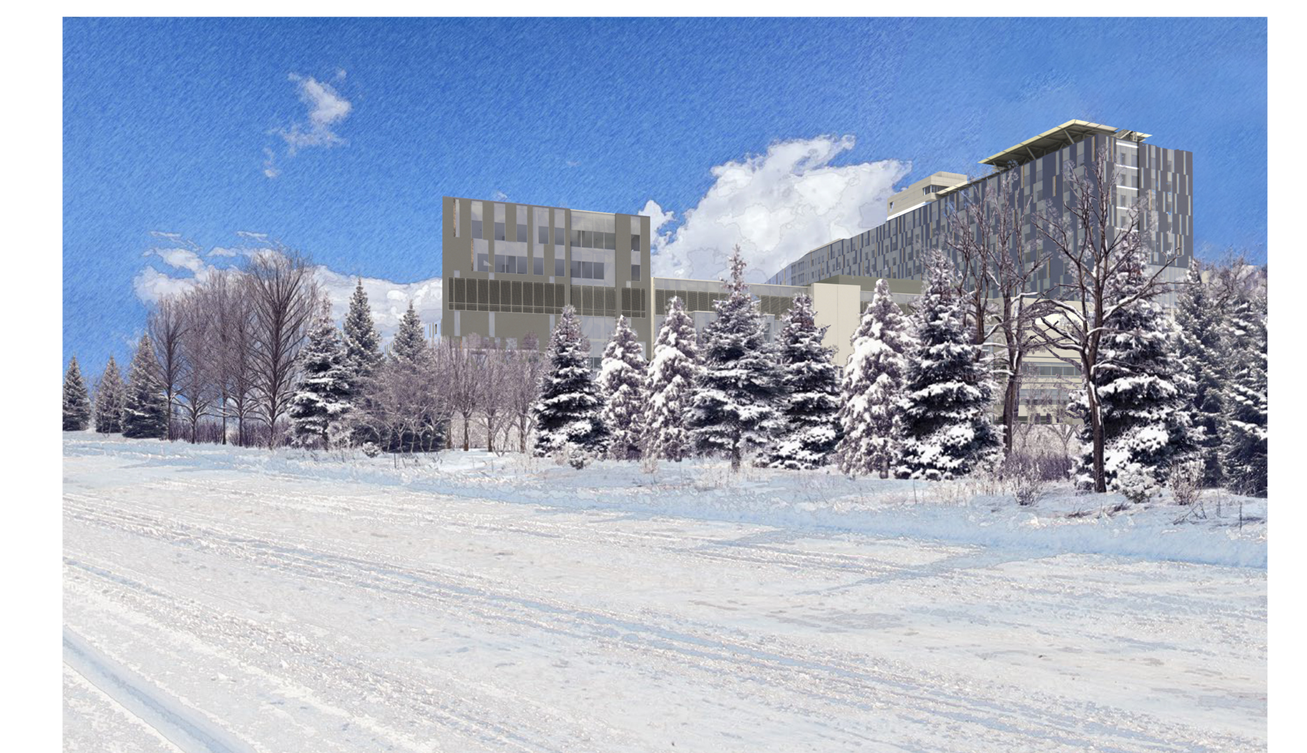
Views Analysis - Referenced Views #9 View from Maple Drive North toward the Hospital in winter, showing approximate 30-year plant growth within the proposed shelter belt