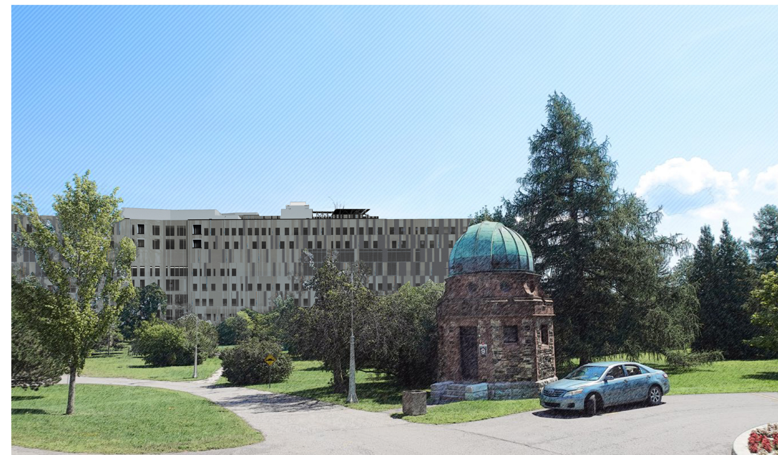
Views Analysis - Referenced Views #7 View from Maple Drive including the Photo Equatorial building as part of the Dominion Observatory in the foreground