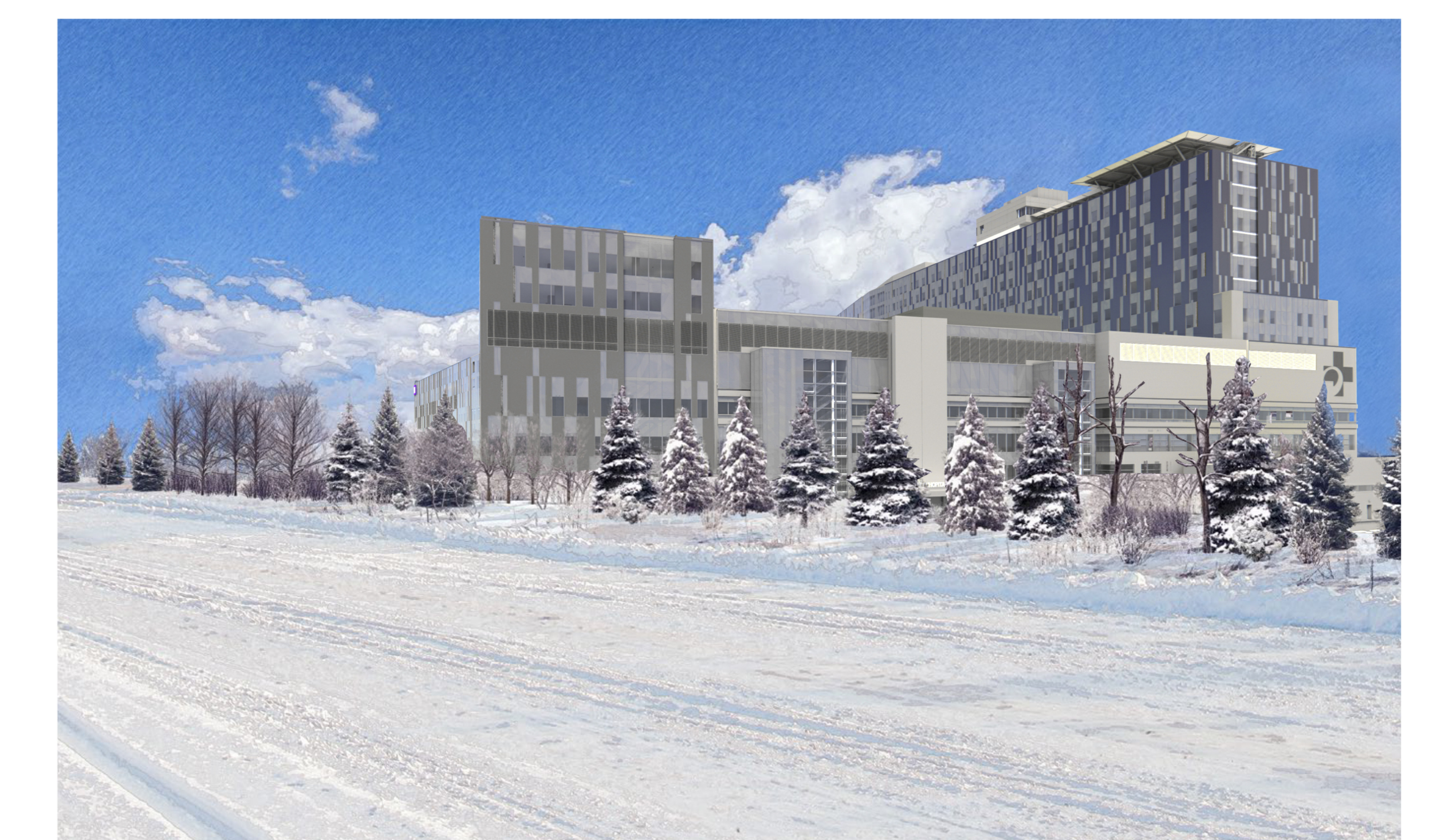
Views Analysis - Referenced Views #9 View from Maple Drive North toward the Hospital in winter, showing approximate 10-year plant growth within the proposed shelter belt