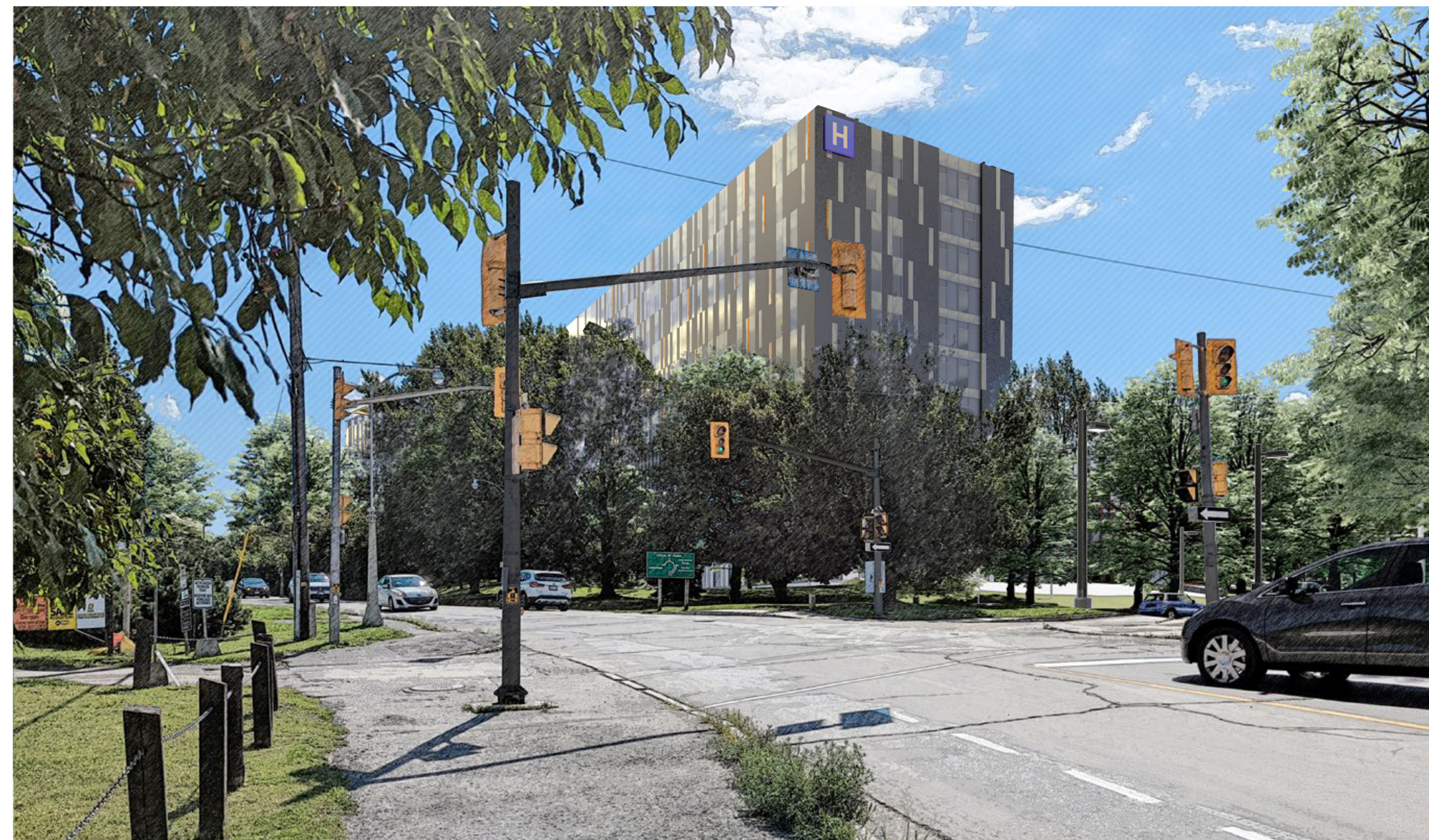
Views Analysis - Referenced Views #2 View from intersection of Prince of Wales Drive and Road B