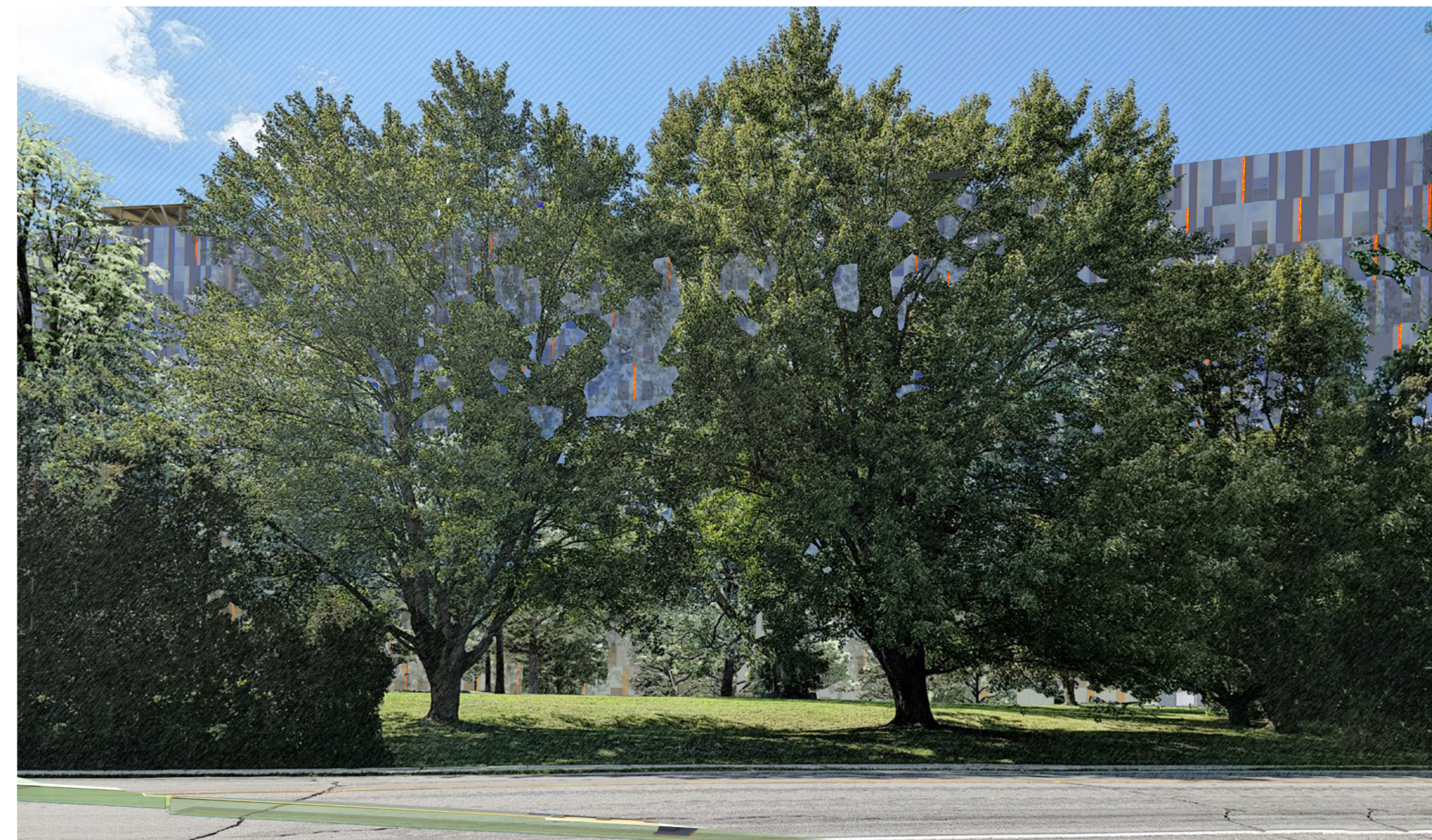
Views Analysis - Referenced Views #1 View from Prince of Wales Drive