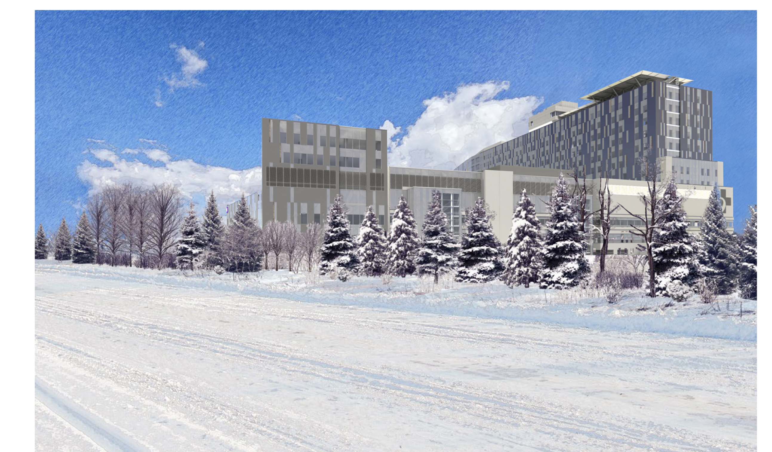
Views Analysis - Referenced Views #9 View from Maple Drive North toward the Hospital in winter, showing approximate 20-year plant growth within the proposed shelter belt