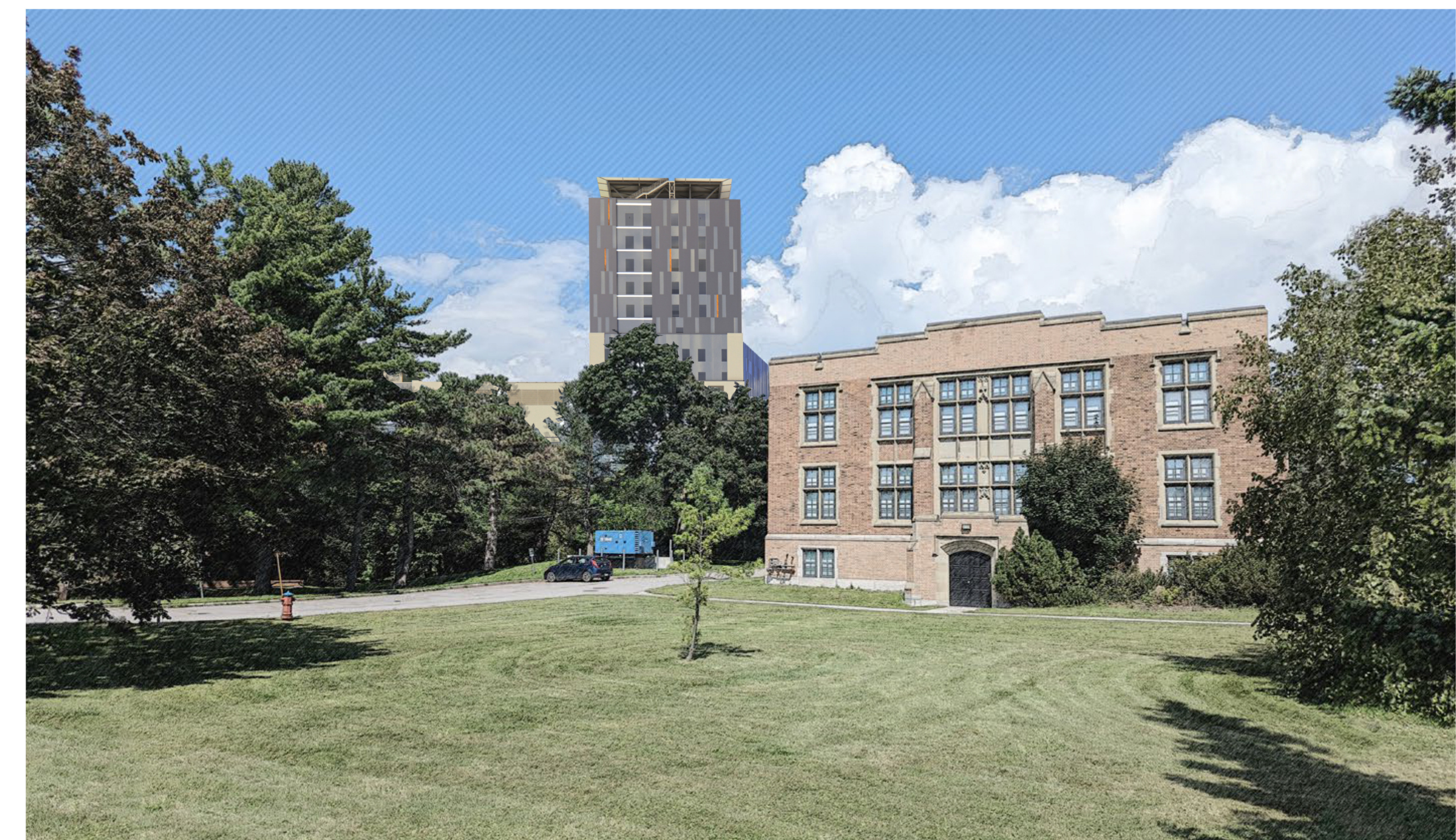
Views Analysis - Referenced Views #8 View from adjacent to the Saunders Building looking North