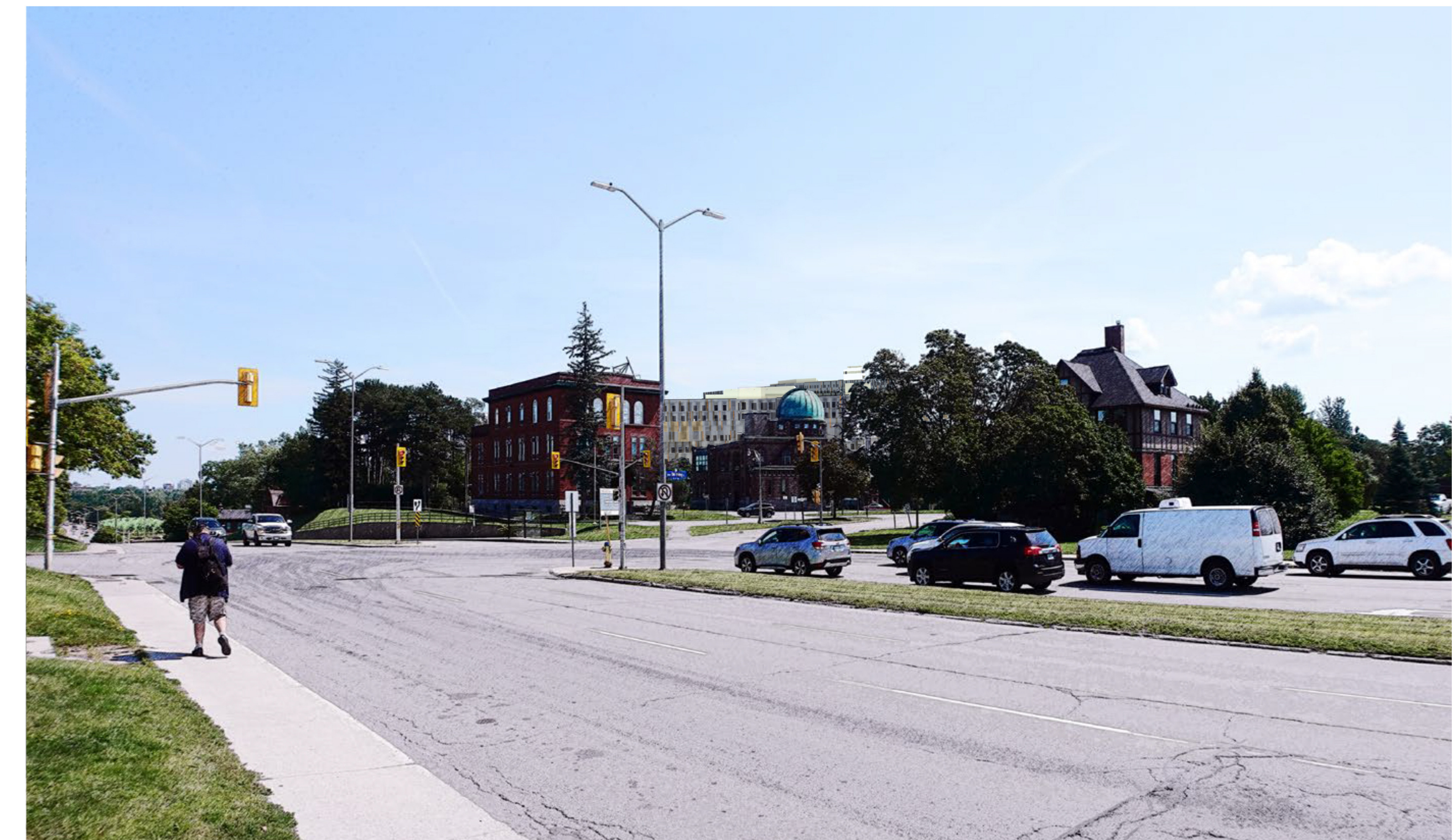
Views Analysis - Referenced Views #4 View South of the intersection of Carling Avenue and Maple Drive