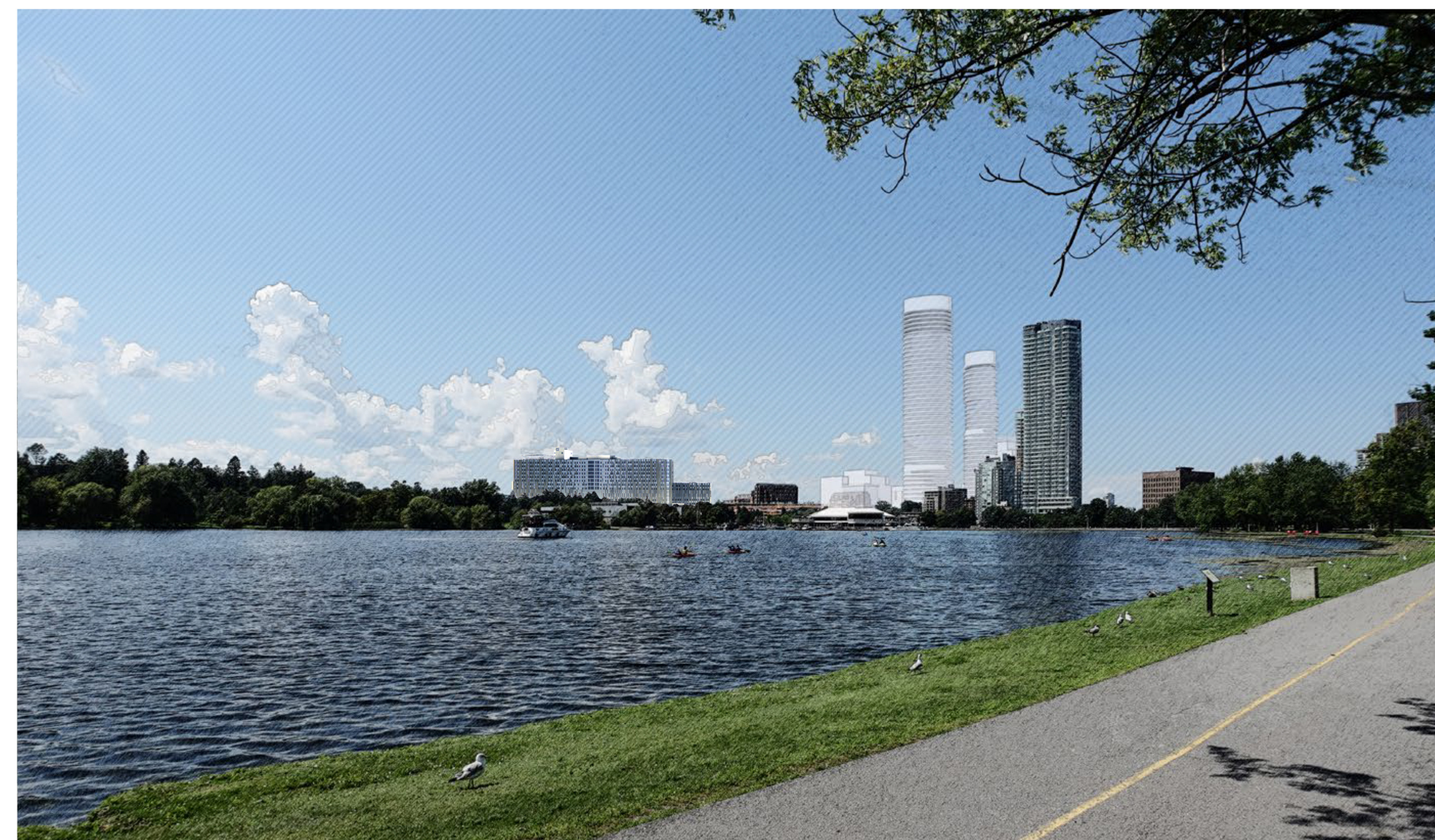
Views Analysis - Referenced Views #5 View from Queen Elizabeth Driveway looking West over Dow's Lake