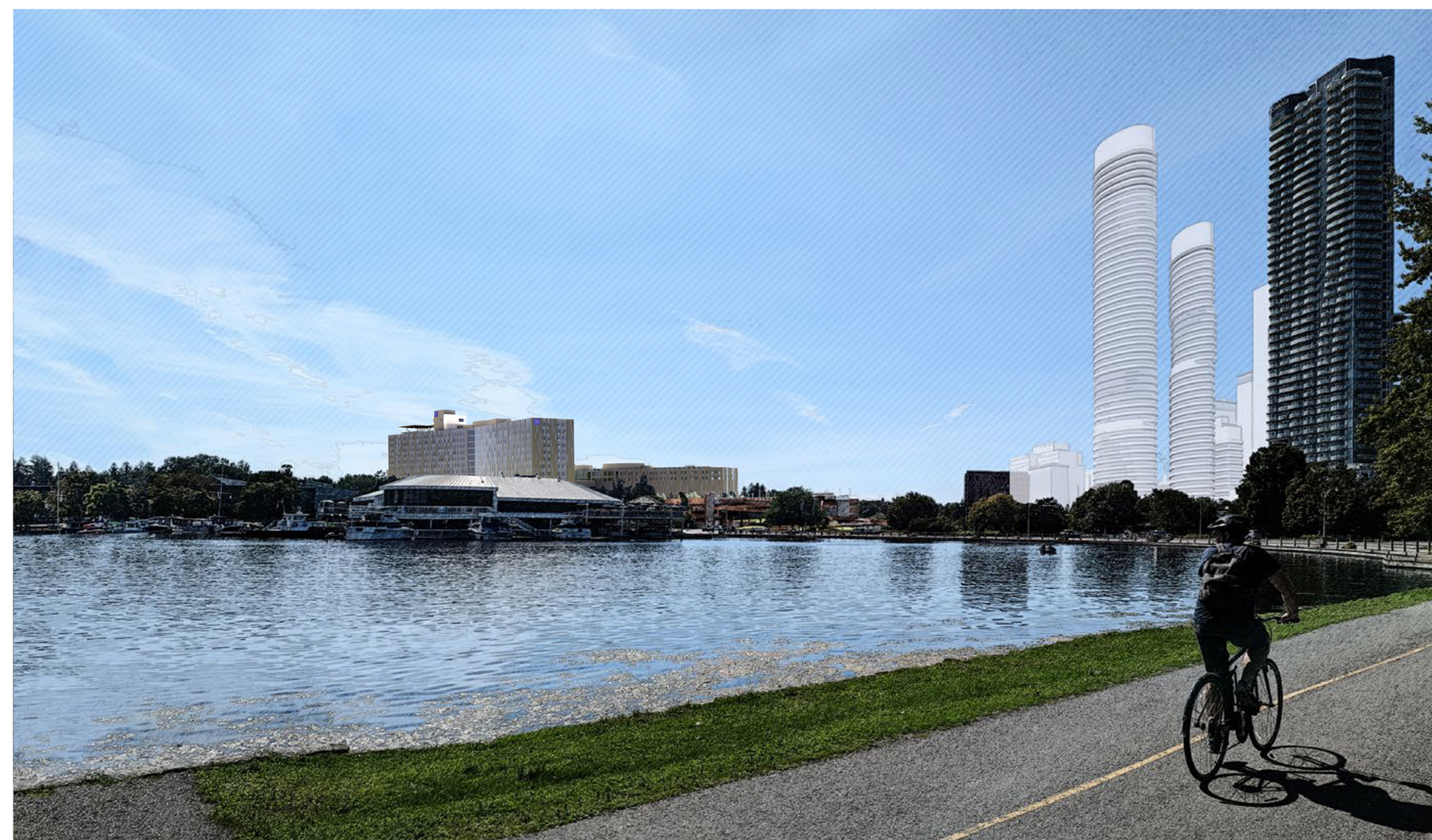
Views Analysis - Referenced Views #6 View from Queen Elizabeth Driveway near Commissioners Park looking Southwest over Dow's Lake