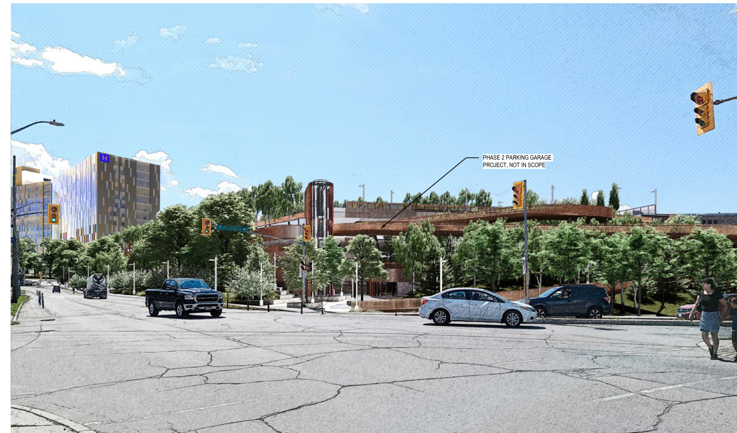
Views Analysis - Referenced Views #3 View from intersection of Prince of Wales Drive and Preston Street