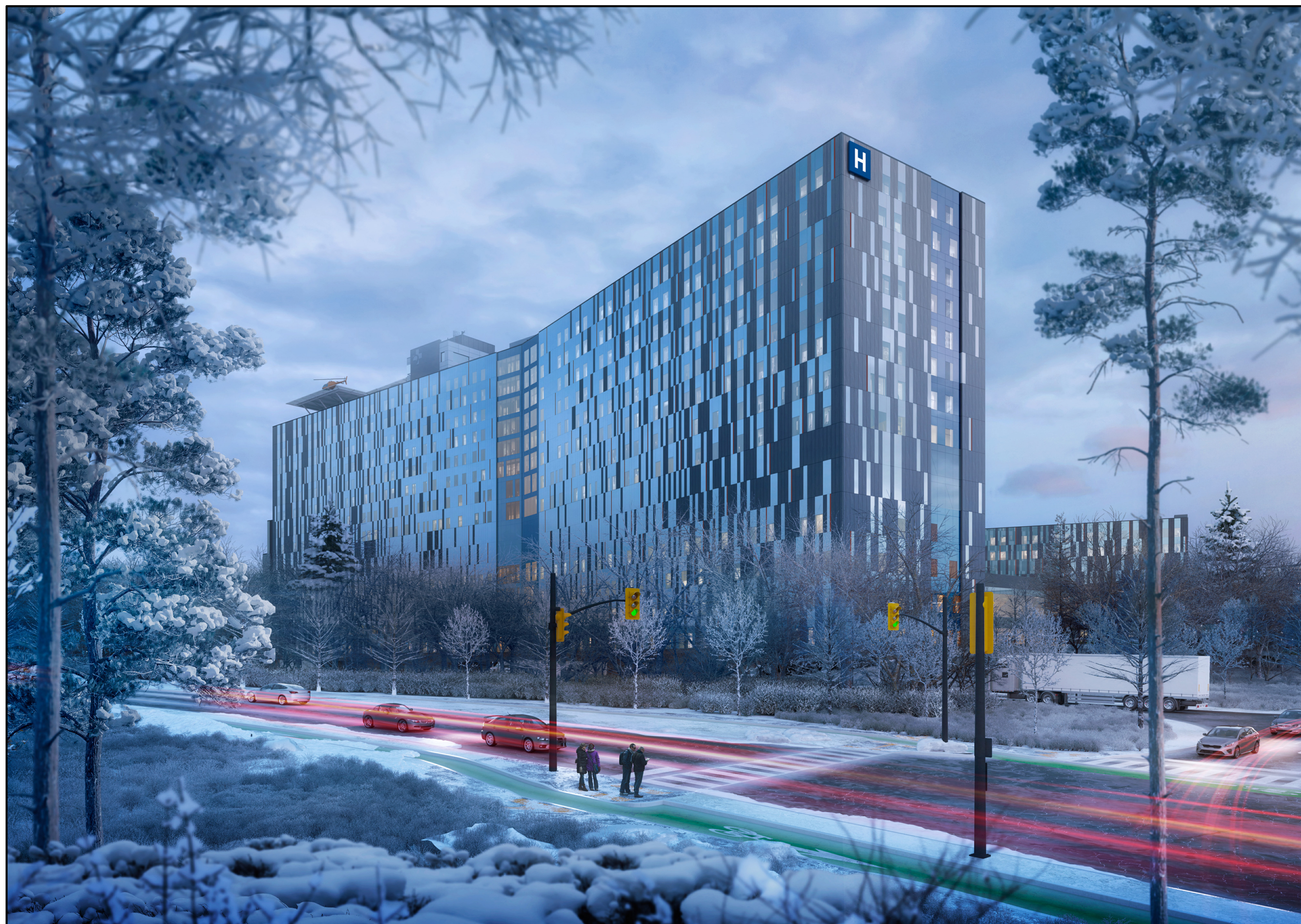
View 6: View of the Facility from the intersection of Prince of Wales Drive and Road B at grade - Winter View