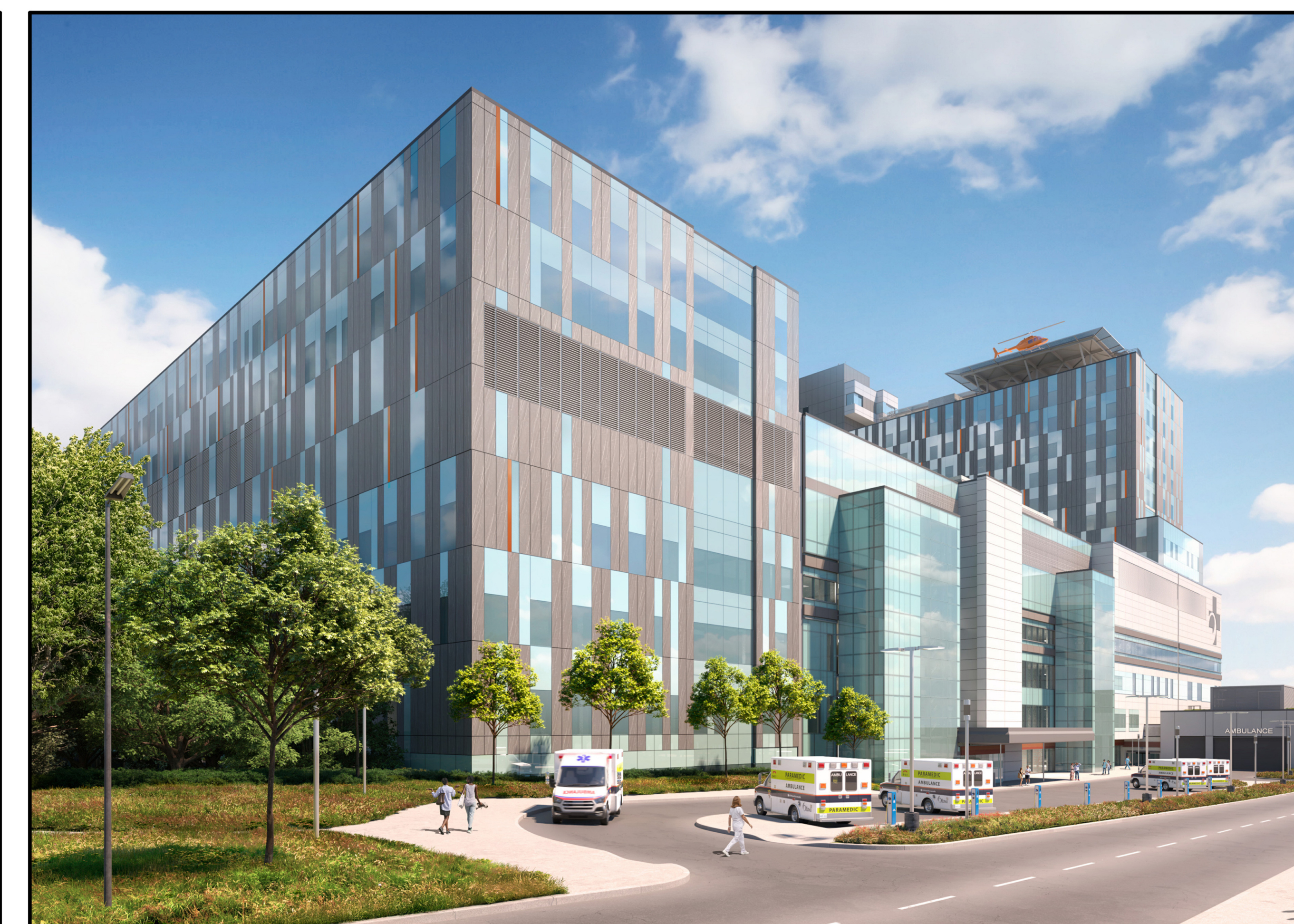
View 5: View of the South West corner and extended facades as seen at grade from Road E