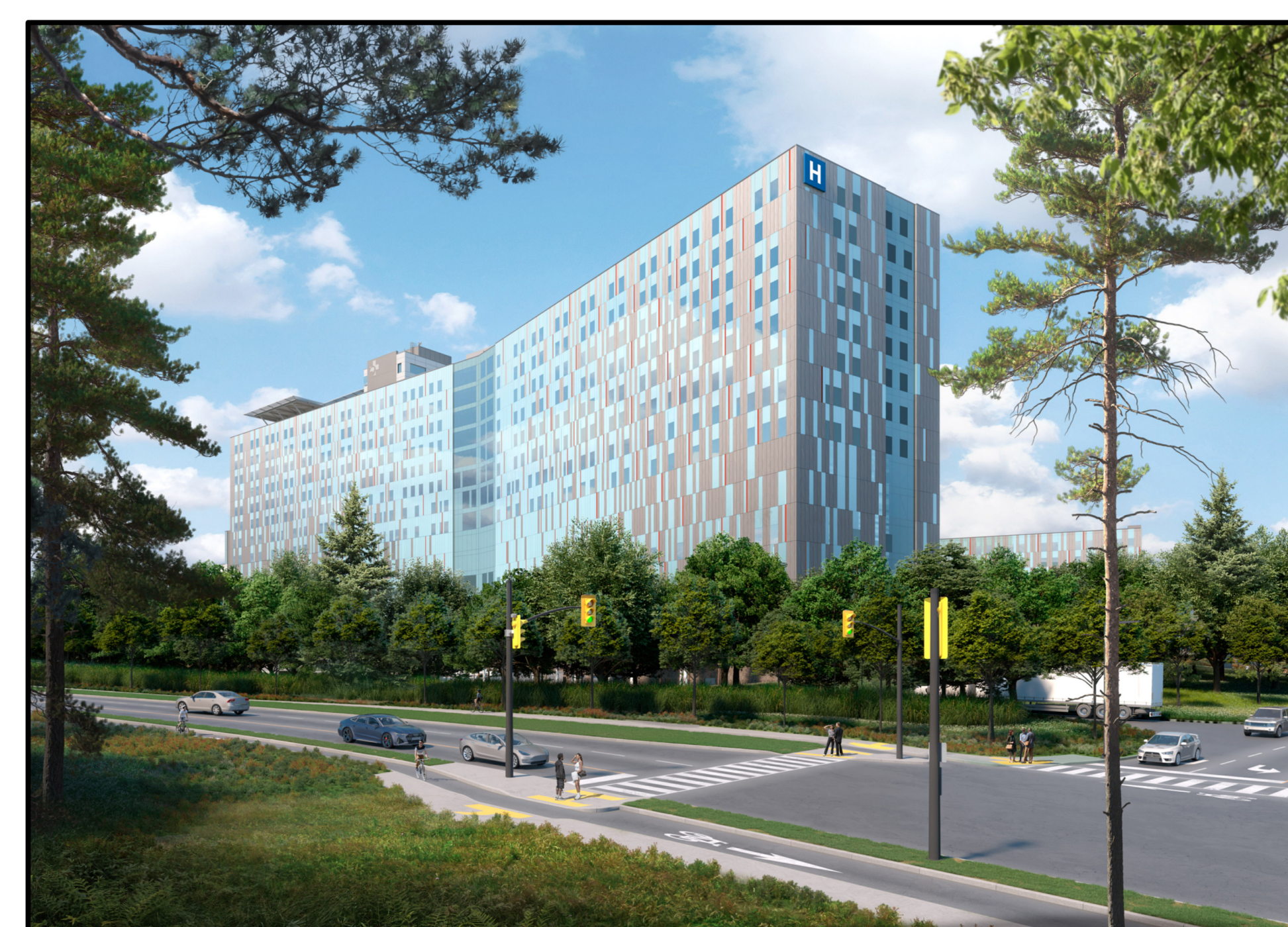
View 6: Summer View

NOTE: 1. RENDERINGS EXHIBIT THE EXPECTED OVERALL QUALITY OF DESIGN RELATED TO ARCHITECTURAL LANGUAGE, MATERIAL USAGE, SPATIAL DESIGN AND LANDSCAPE. RENDERINGS ARE NOT INDICATIVE OF ALL REQUIRED ELEMENTS, INCLUDING, BUT NOT LIMITED TO, FENCING, SIGNAGE, PASSENGER AMENITIES, BIRD FRIENDLY DESIGN REQUIREMENTS, FURNITURE ETC. 2. RENDERINGS SHOW PLANTING AT MATURING, NOT SHOWING SIZE AT INSTALLATION.