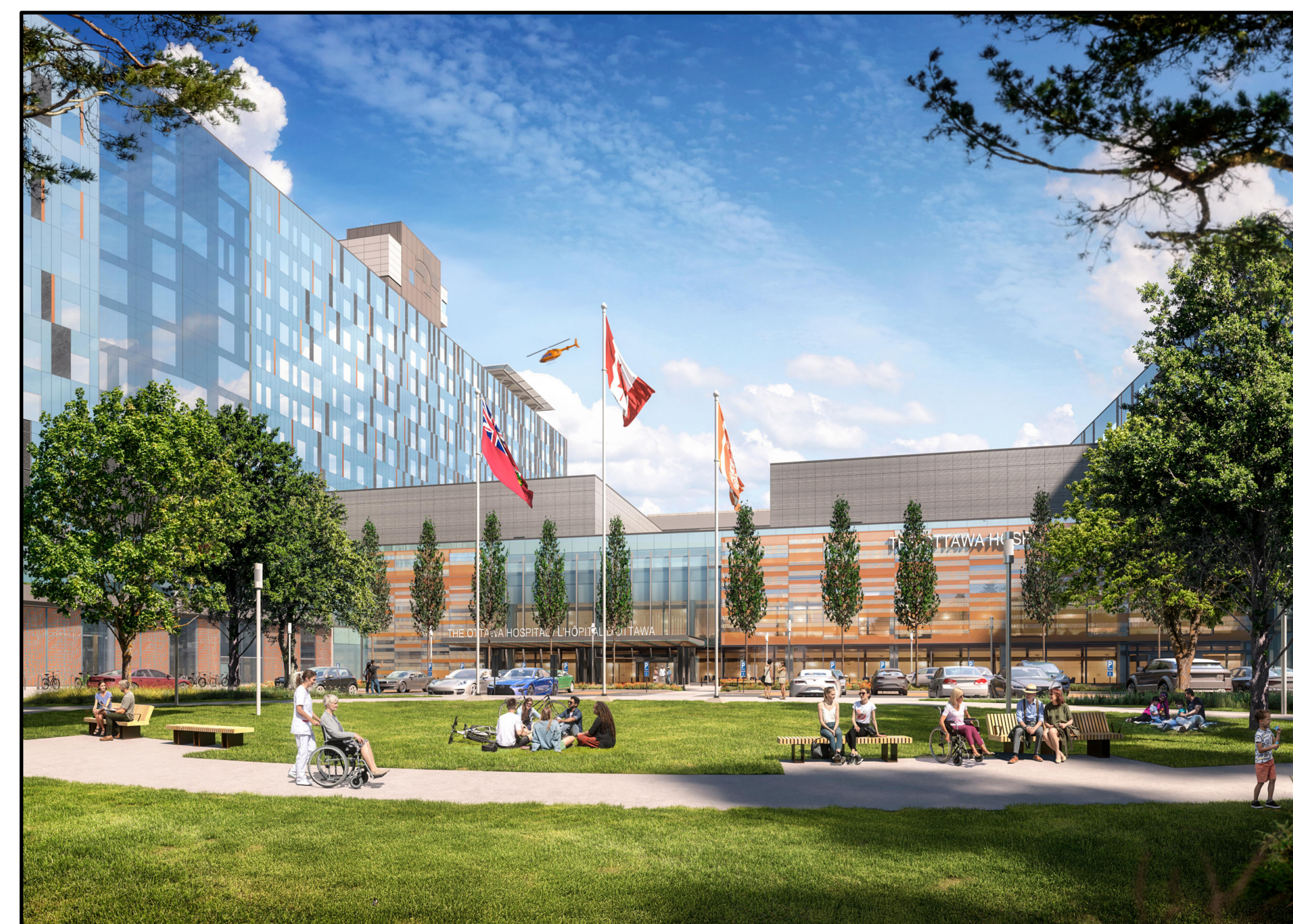
View 2: Main Plaza, Concourse as viewed from the Overlook