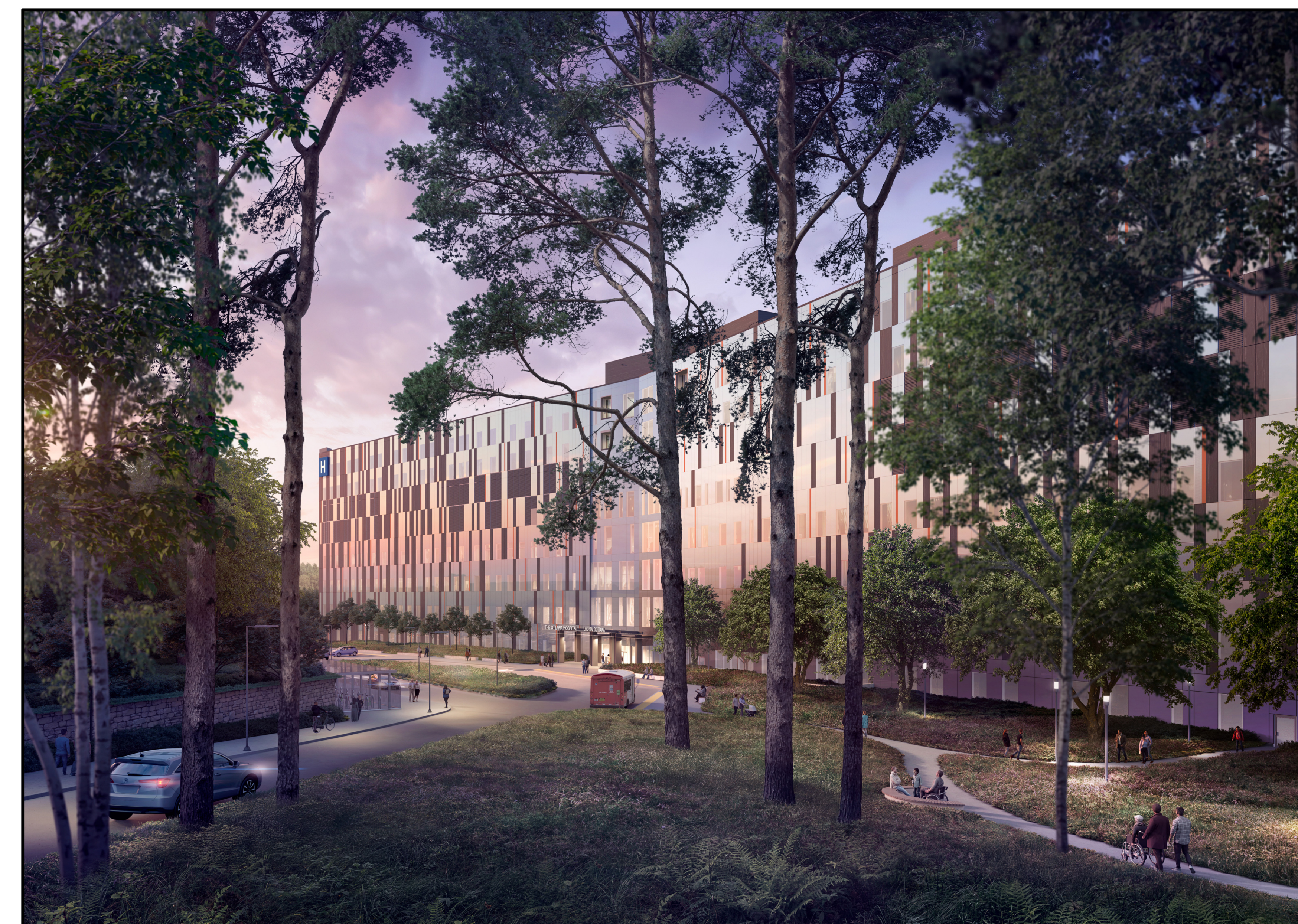
View 4: View of the West Entrance as seen at grade from the approach on Road D