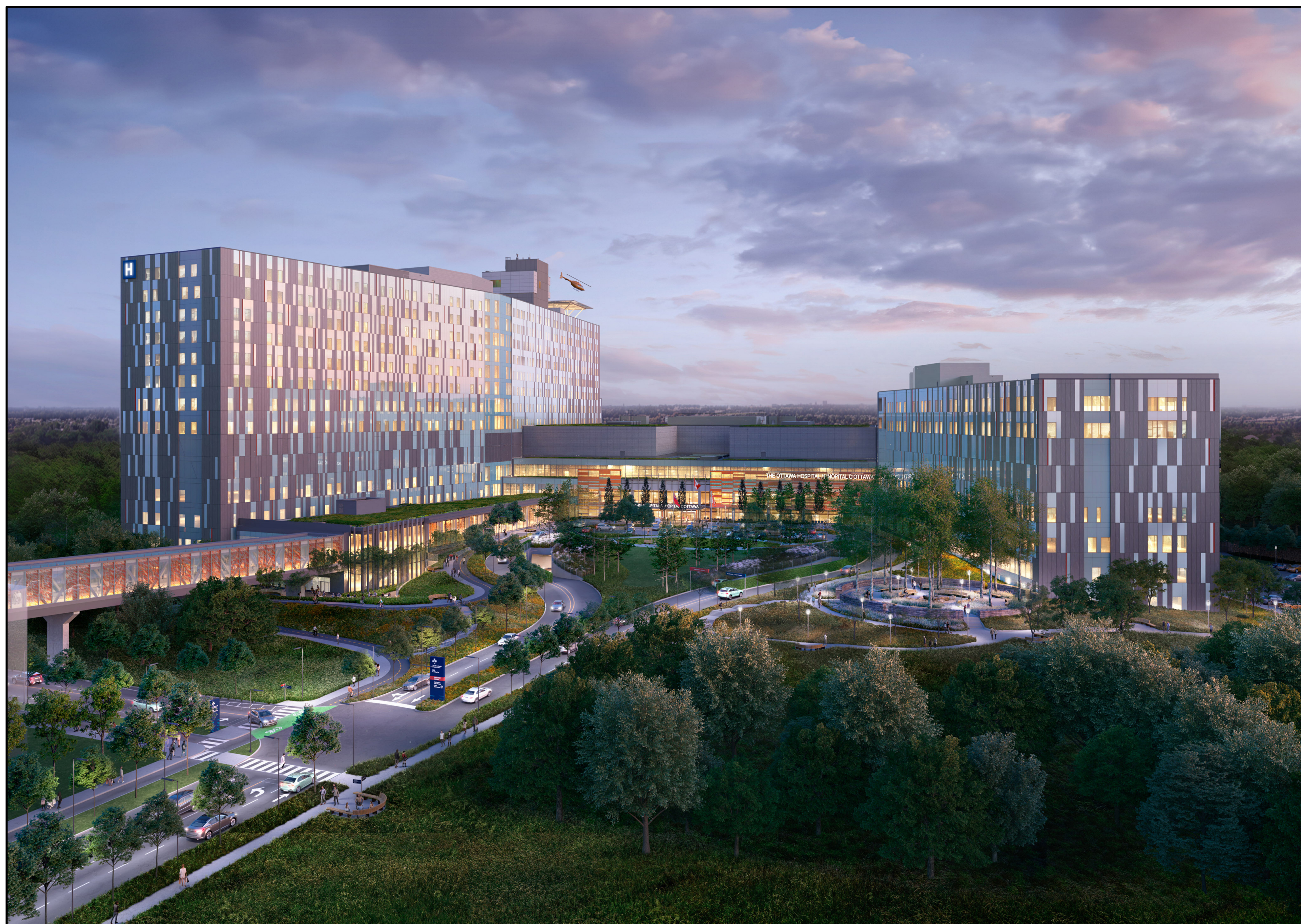
View 1: View of the overall facility as seen from the air over the intersection of Preston Street and Carling Avenue - Evening View