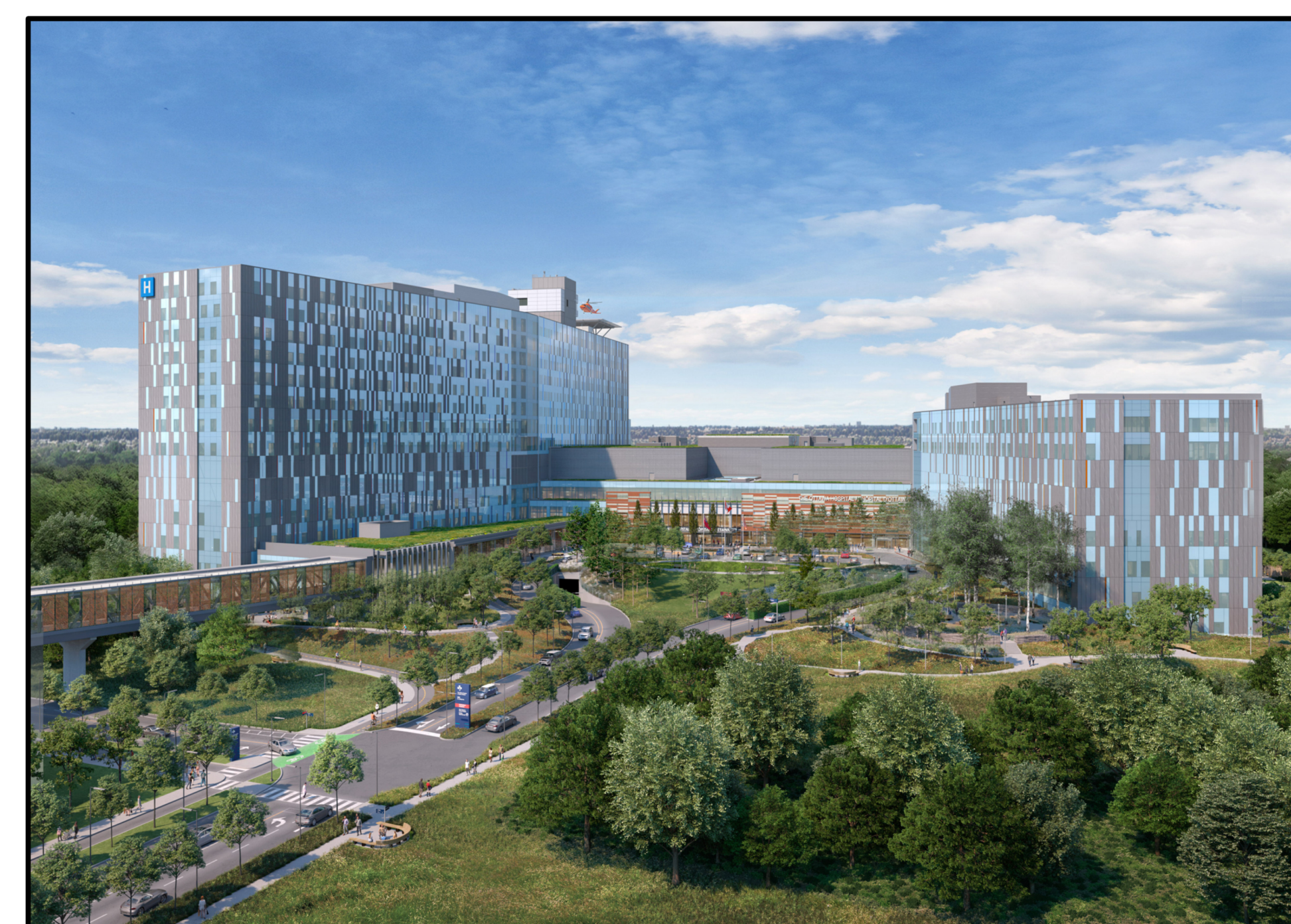
View 1: Day View