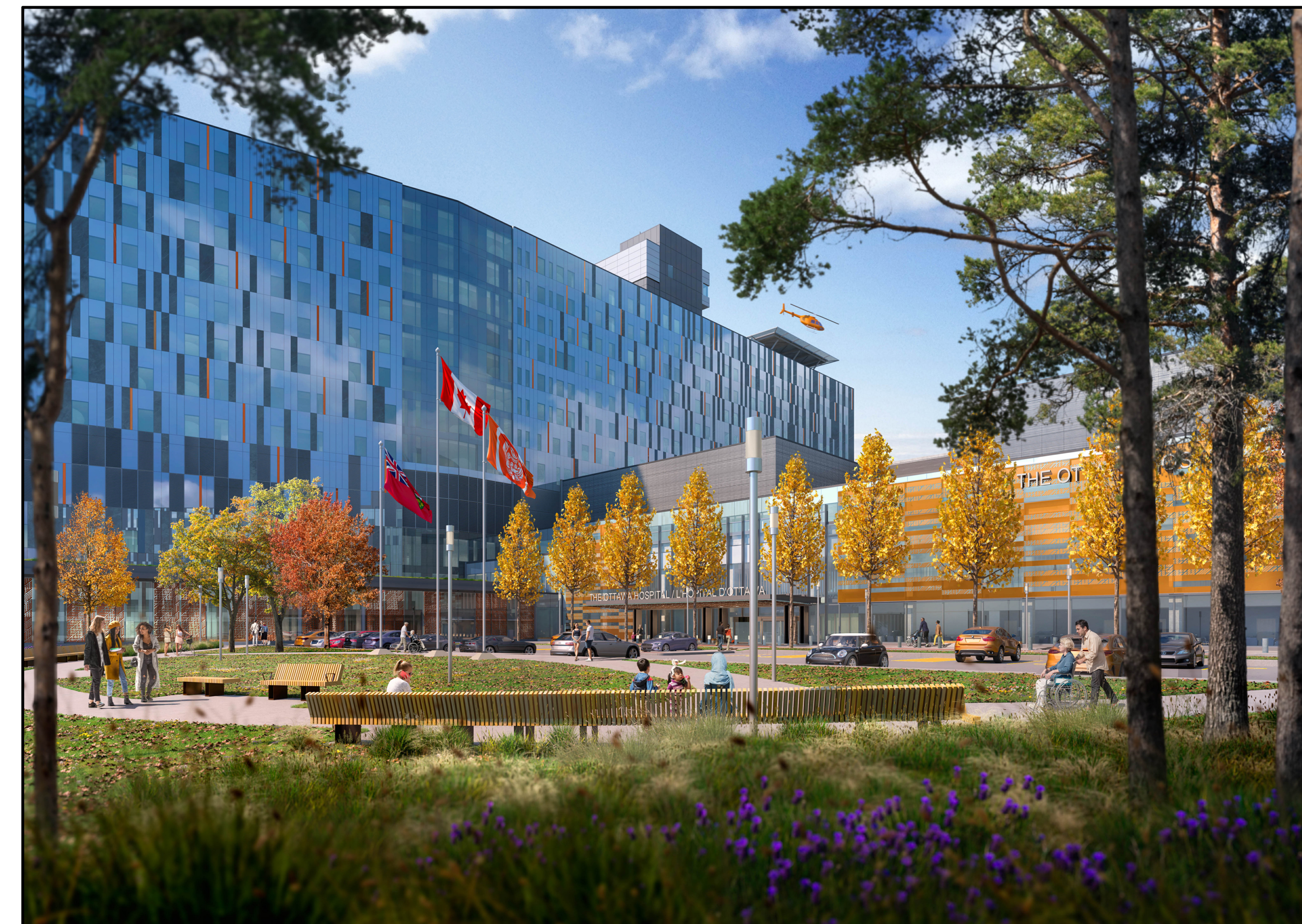
View 3: Main Plaza, Concourse, Towers B and Pavilion as viewed at grade from the Main Plaza

NOTE: 1. RENDERINGS EXHIBIT THE EXPECTED OVERALL QUALITY OF DESIGN RELATED TO ARCHITECTURAL LANGUAGE, MATERIAL USAGE, SPATIAL DESIGN AND LANDSCAPE. RENDERINGS ARE NOT INDICATIVE OF ALL REQUIRED ELEMENTS, INCLUDING, BUT NOT LIMITED TO, FENCING, SIGNAGE, PASSENGER AMENITIES, BIRD FRIENDLY DESIGN REQUIREMENTS, FURNITURE ETC. 2. RENDERINGS SHOW PLANTING AT MATURING, NOT SHOWING SIZE AT INSTALLATION.