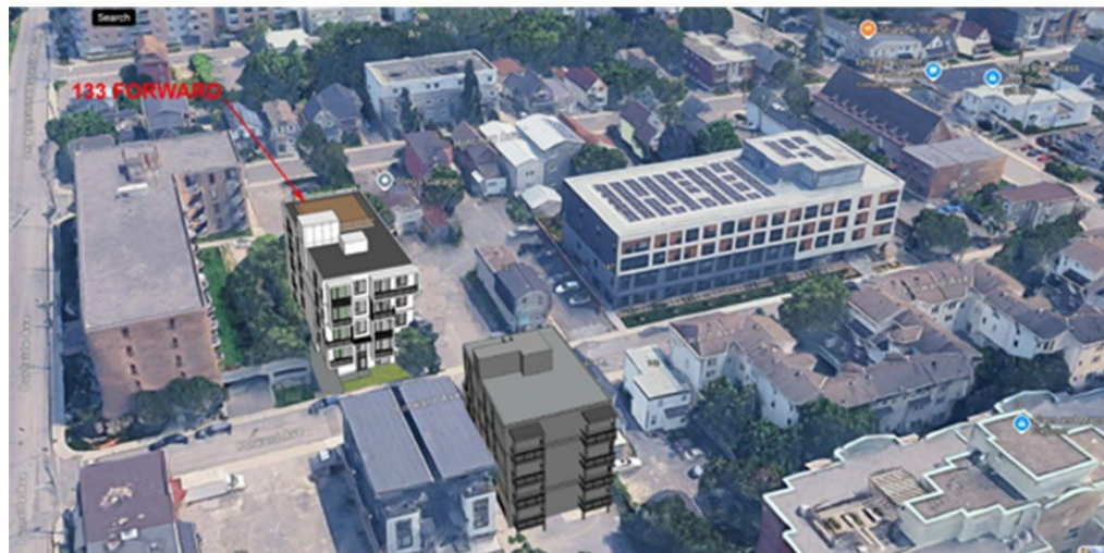
NEW AERIAL VIEW 1