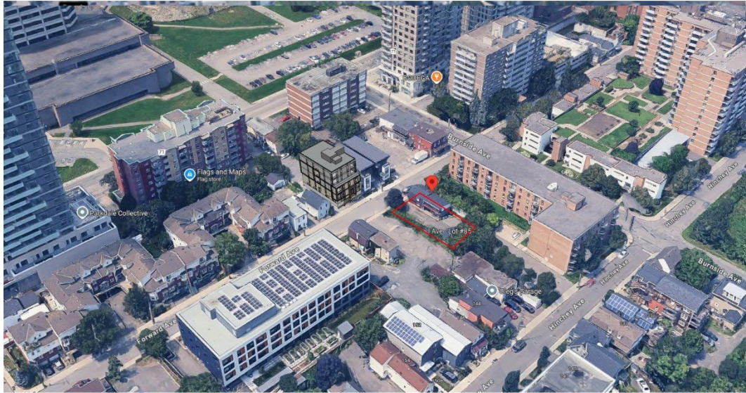
EXISTING AERIAL VIEW 2