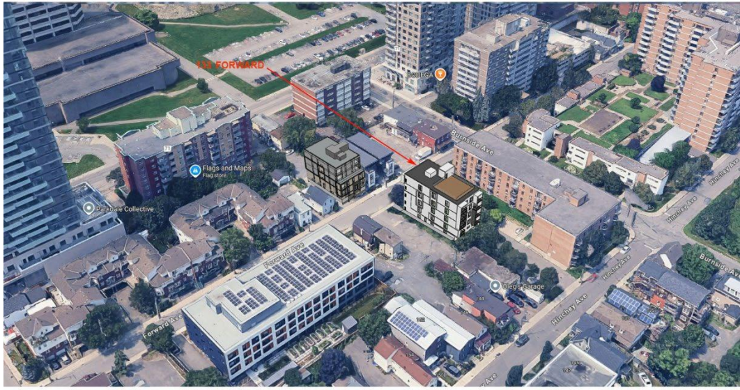
NEW AERIAL VIEW 2