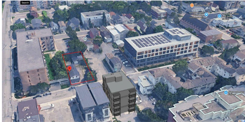
EXISTING AERIAL VIEW 1