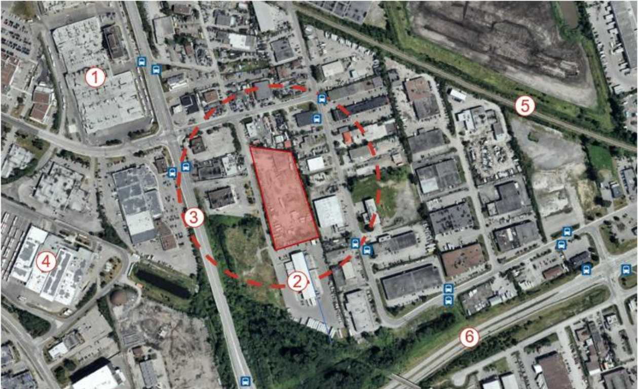
Figure 6: Neighbourhood