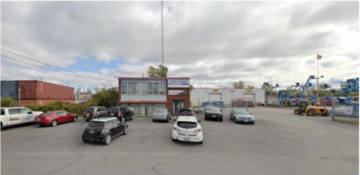
5 1547 LAGAN WAY, EXISTING STRUCTURE ON PROPERTY VIEW TOWARDS PROPERTY – EAST