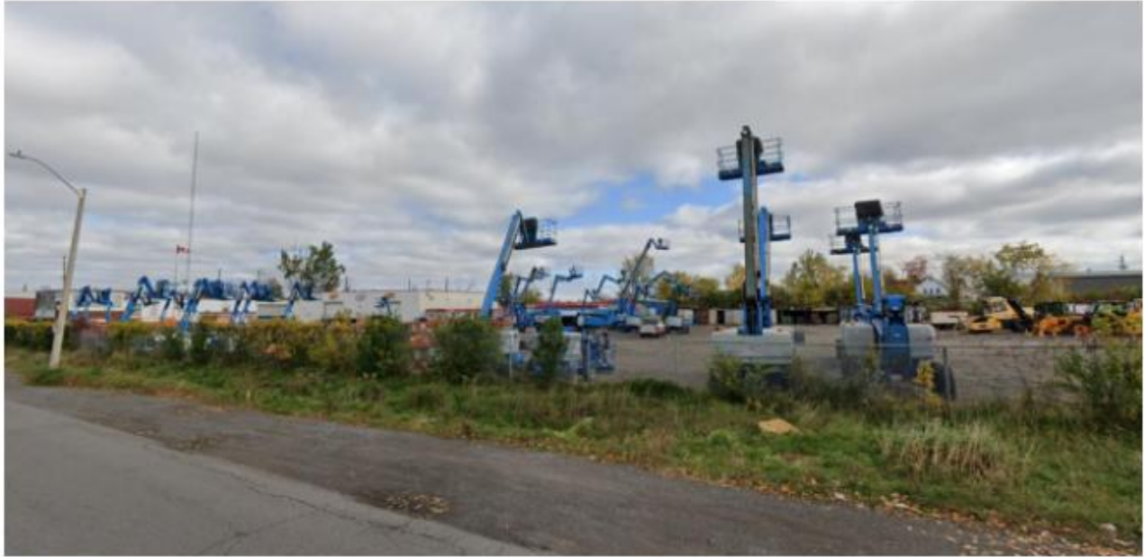
1 1547 LAGAN WAY, PROPOSED SITE VIEW TOWARDS PROPERTY – NORTH EAST