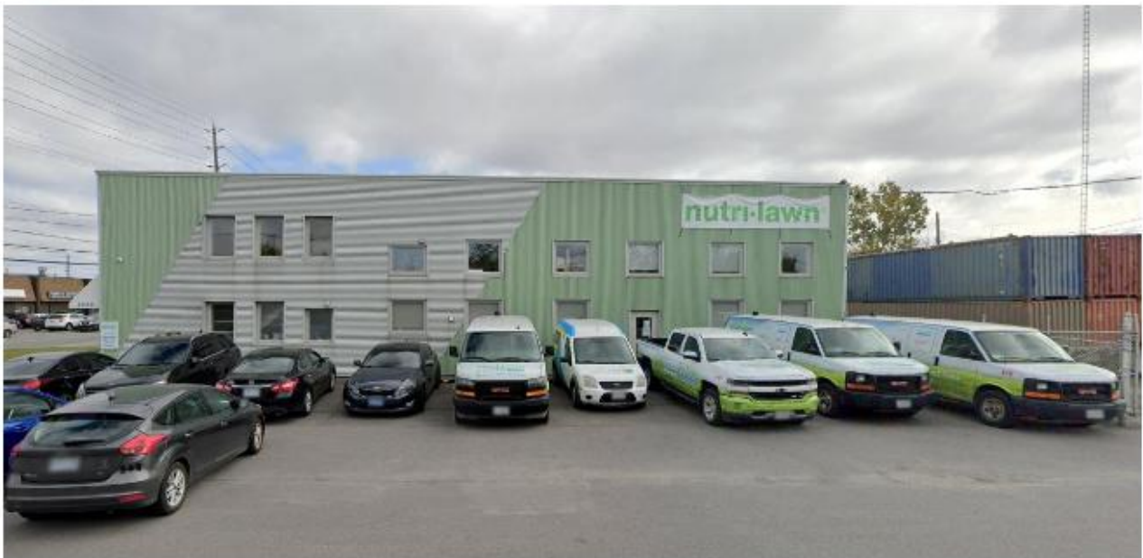
4 ADJACENT PROPERTY, NUTRI-LAWN VIEW TOWARDS PROPERTY – NORTH WEST