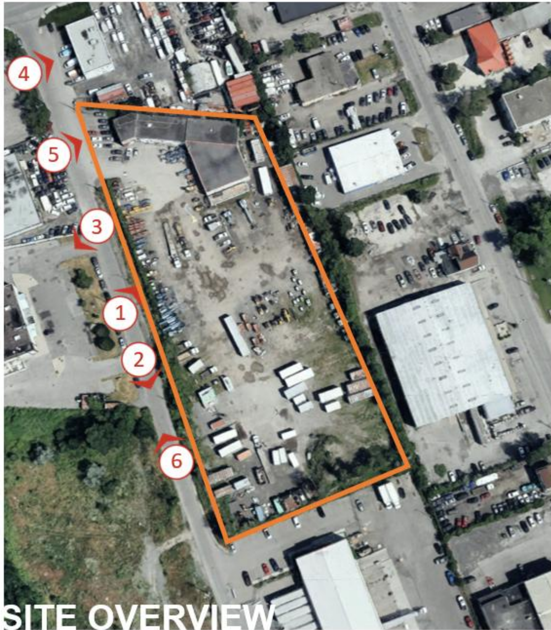
Figure 7: 100m Radius