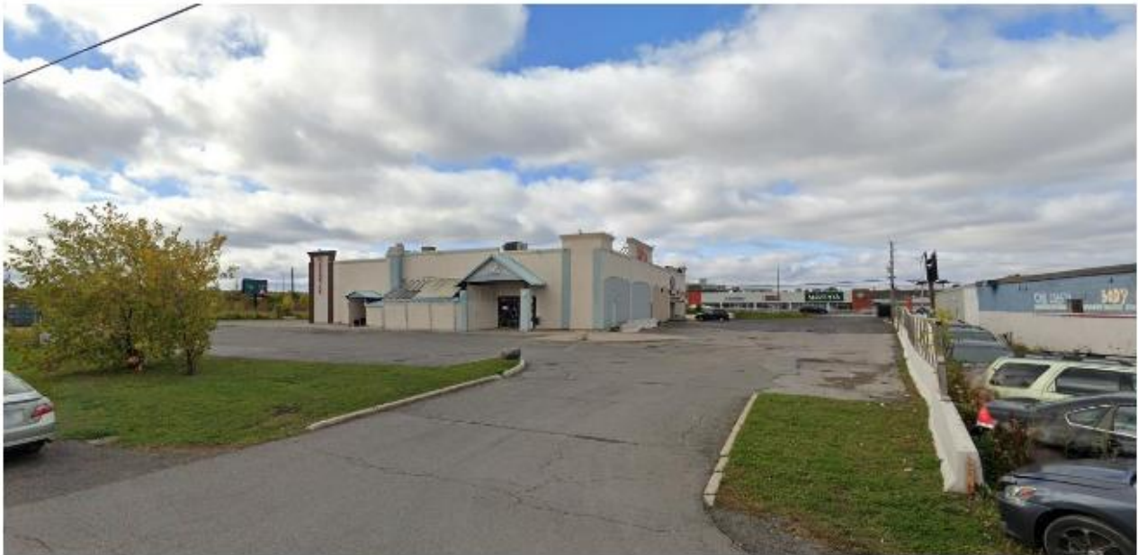
3 1560 LAGAN WAY VIEW OF OPPOSING PROPERTY – WEST