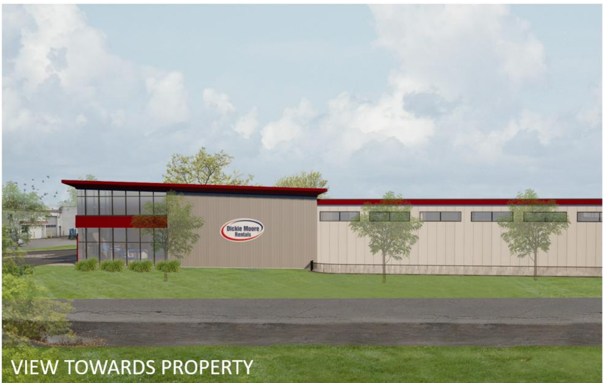
VIEW TOWARDS PROPERTY