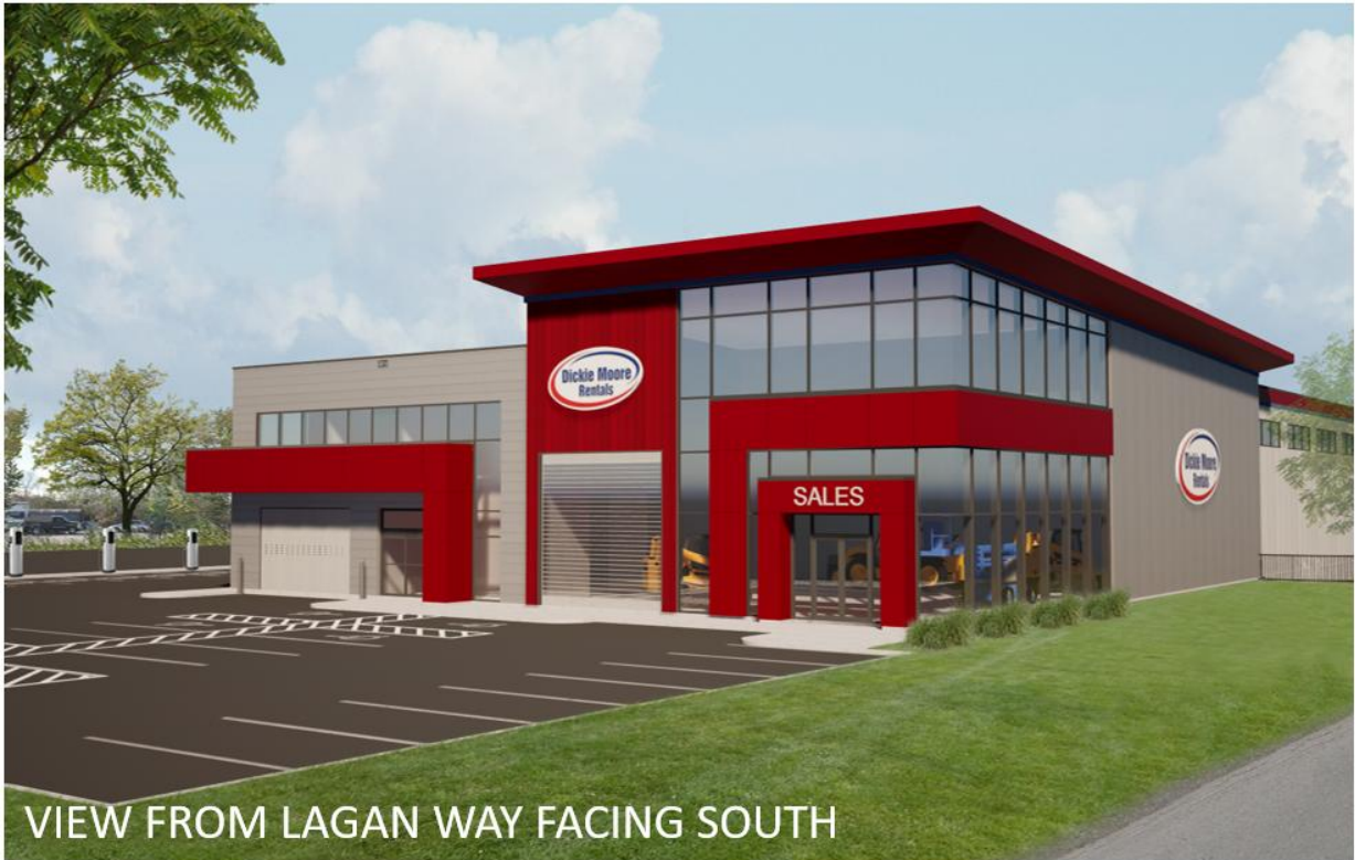
VIEW FROM LAGAN WAY FACING SOUTH