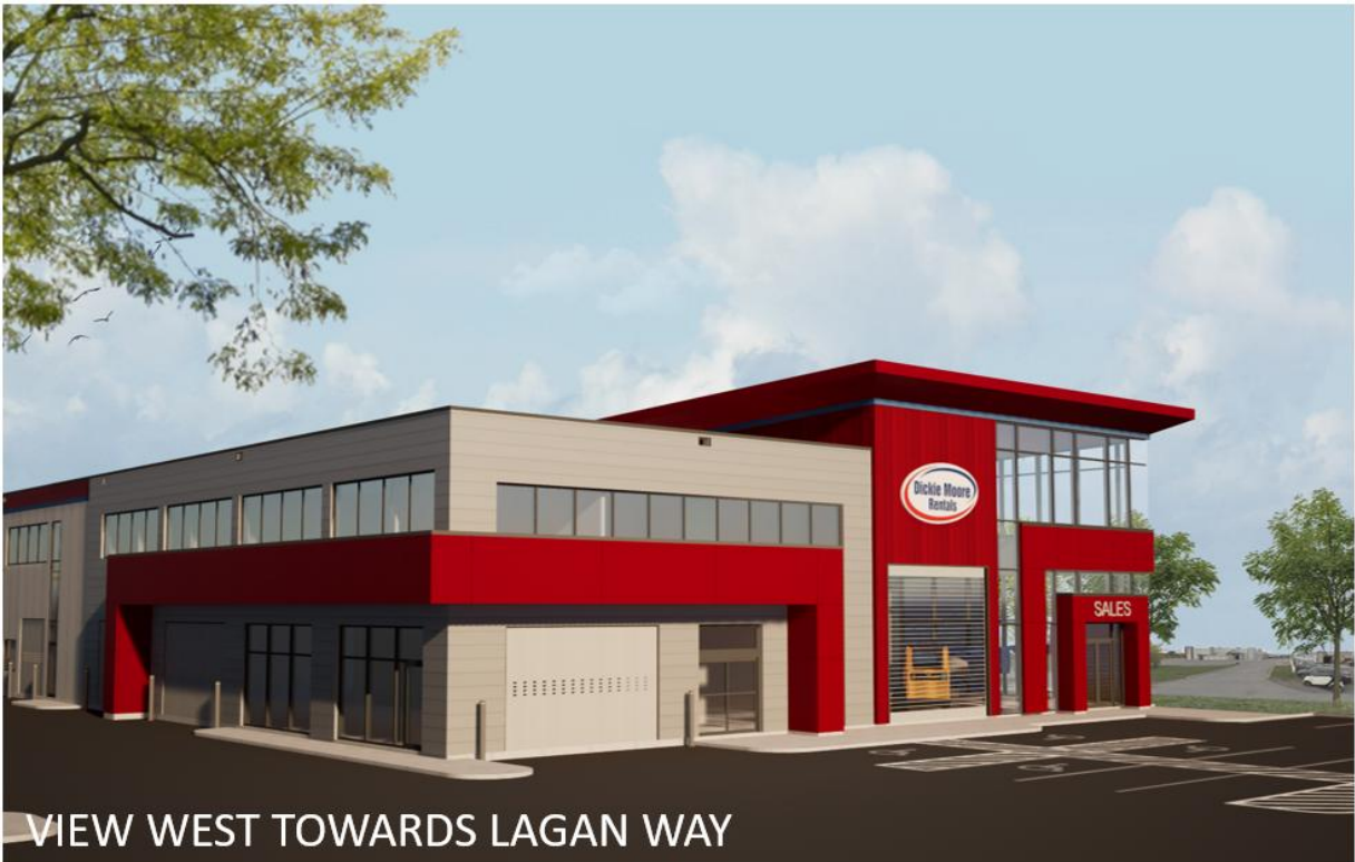
VIEW WEST TOWARDS LAGAN WAY