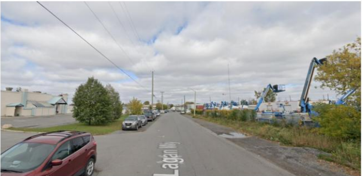
6 LAGAN WAY VIEW TOWARDS PROPERTY – NORTH