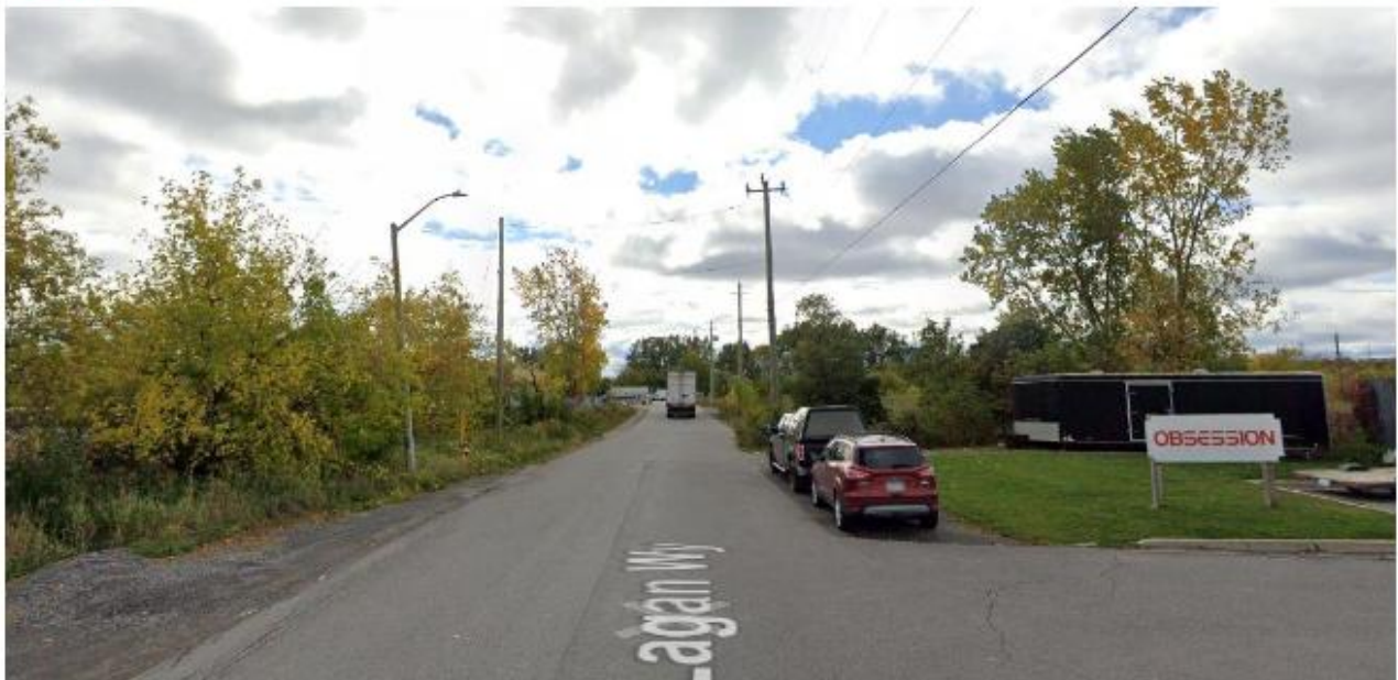
2 LAGAN WAY, SOUTH OF PROPOSED SITE VIEW TOWARDS ADJACENT PROPERTY – SOUTH EAST