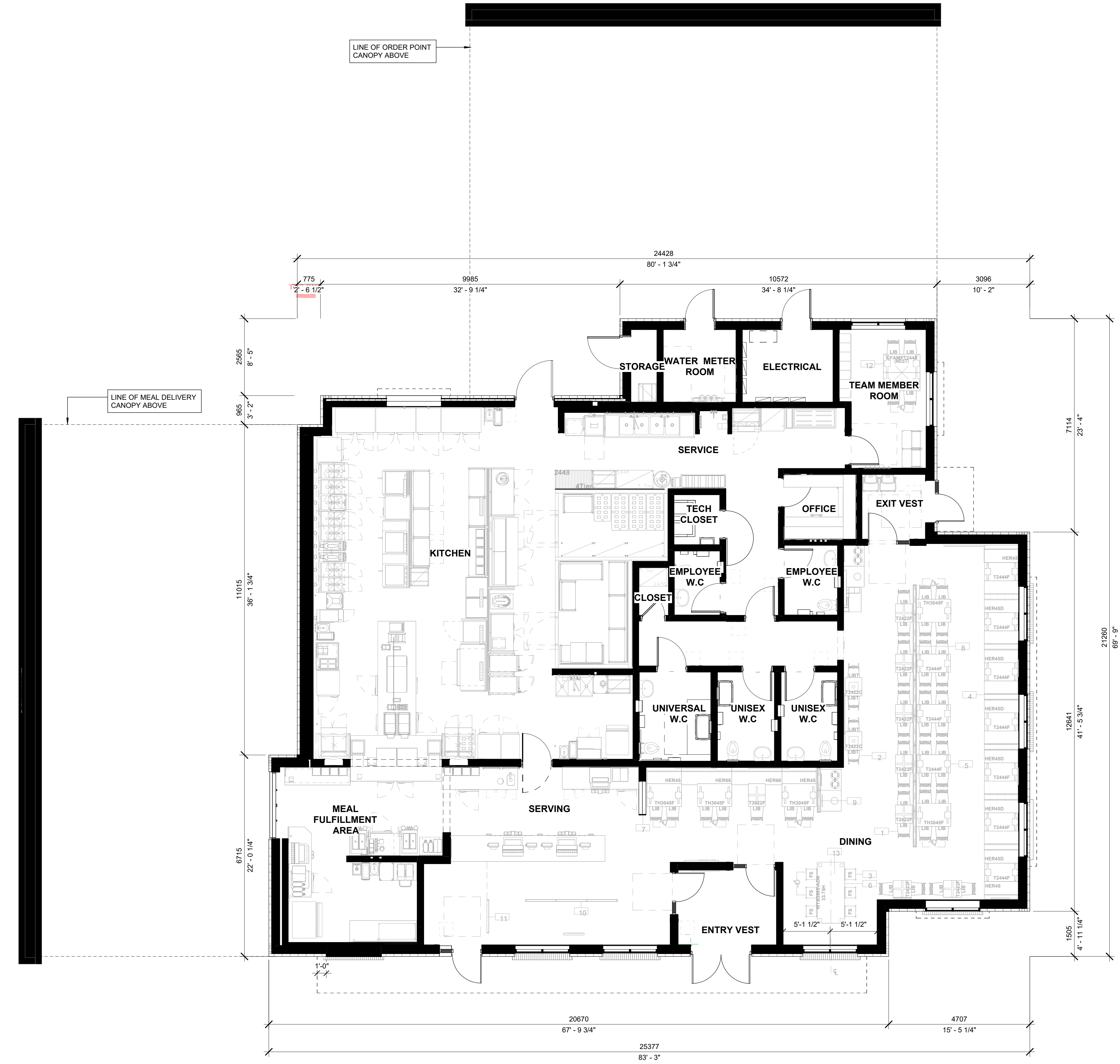
A4 FLOOR PLAN 1:70