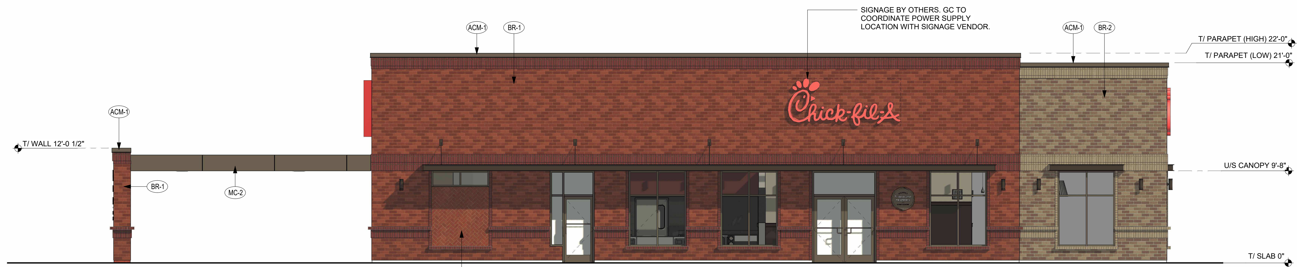
A3 EXTERIOR ELEVATION 1:70