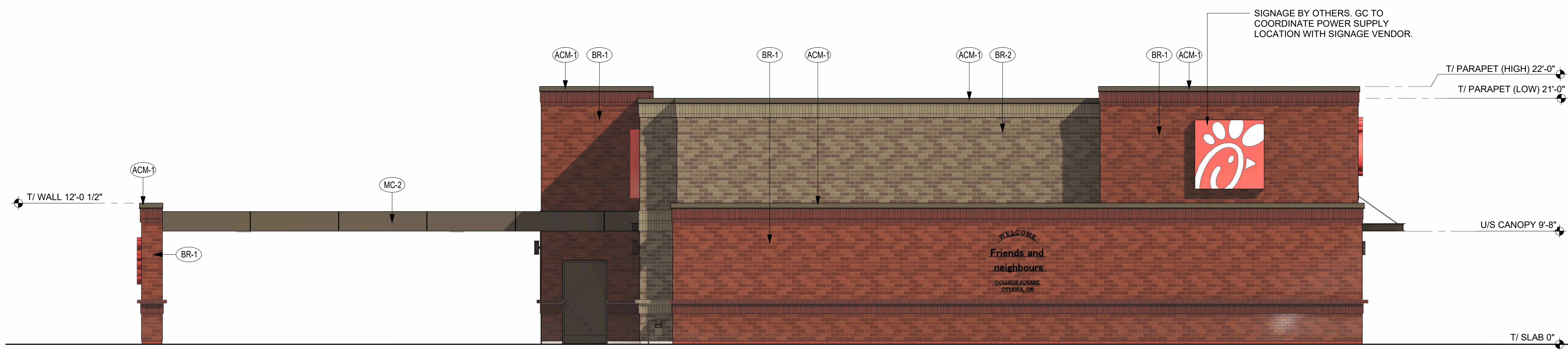
B3 EXTERIOR ELEVATION 1:70