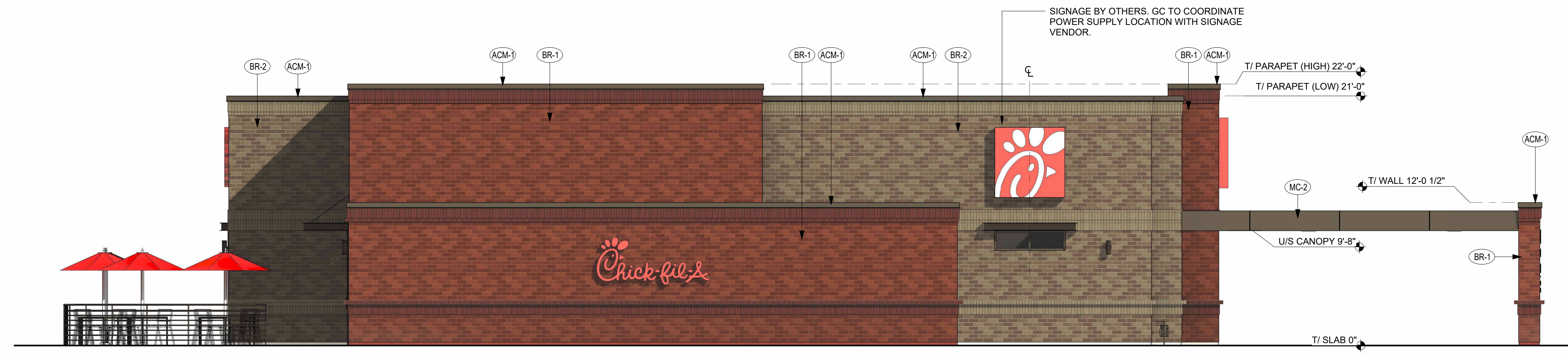
C3 EXTERIOR ELEVATION 1:70