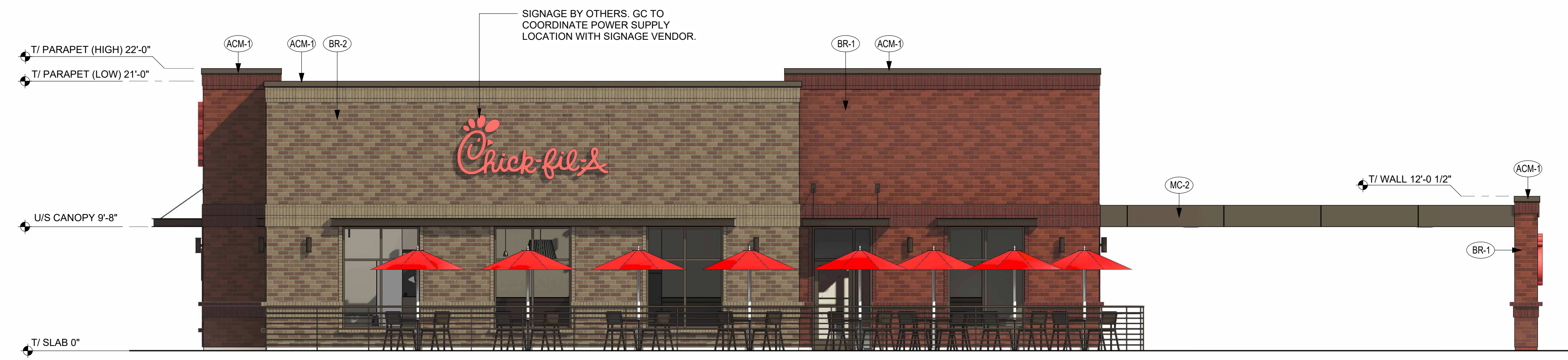
D3 EXTERIOR ELEVATION 1:70