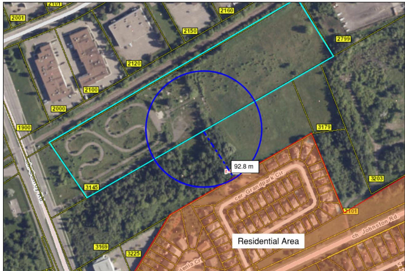
Figure 4-1. Separation Distance from Nearby Residential Area

As noted in section 3, a nearby residential neighbourhood located south of the Site, north of Johnston Road and Place of Worship at 3225 Conroy Road are the closest sensitive land uses to the proposed development. These properties are located approximately 92.8 metres from the Site, which is outside the Potential Influence Area and Minimum Separation Distance (see Figure 4-1 ). This distance meets the guidelines for adequate separation for minimizing and mitigating adverse effects which is 70 metres for Class II Facilities.