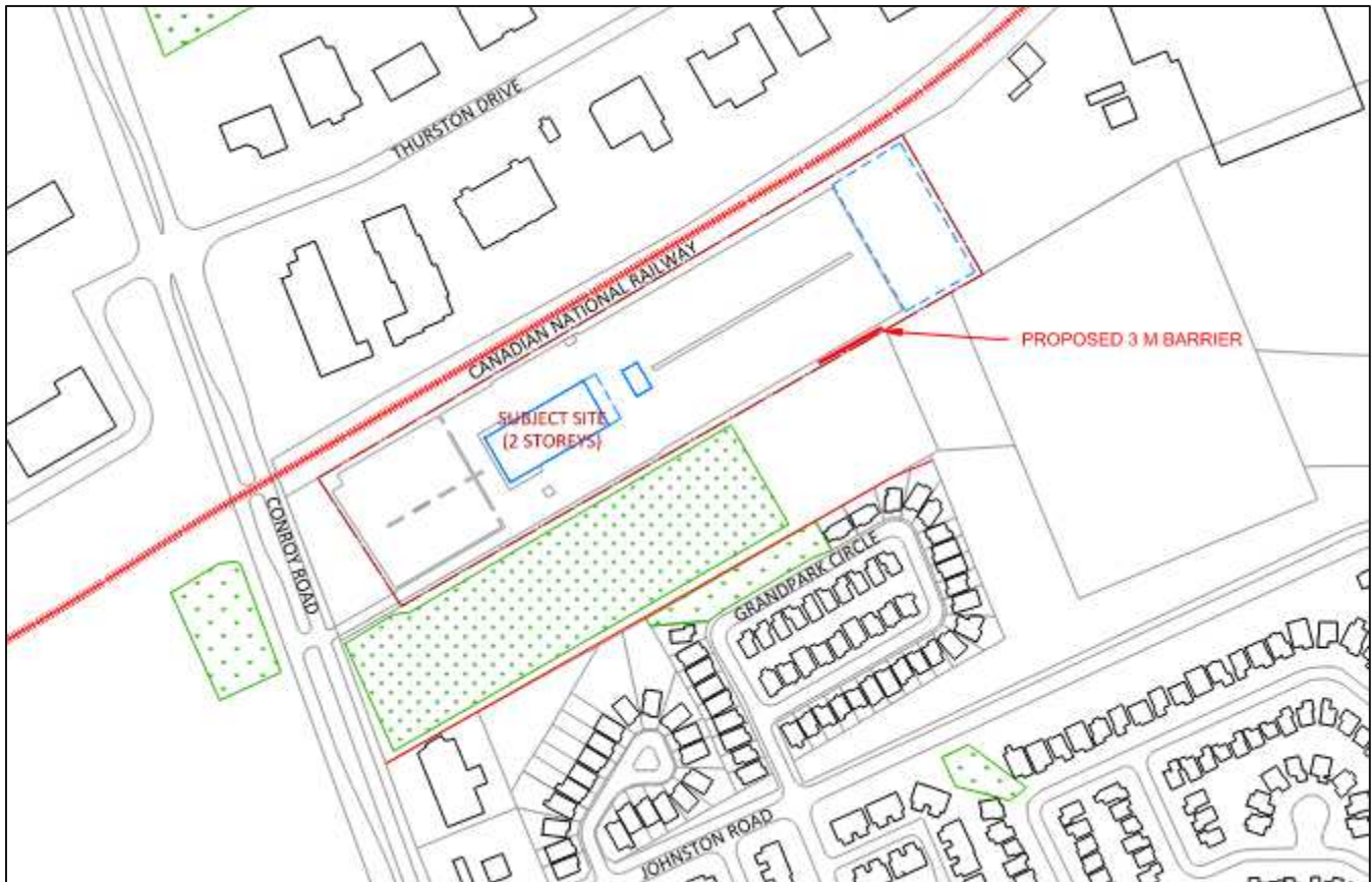
Figure 4-1: Proposed Noise Wall Location (GWE, 2025)

As such, the proposed development is expected to be compatible with the existing and future noise-sensitive land uses.