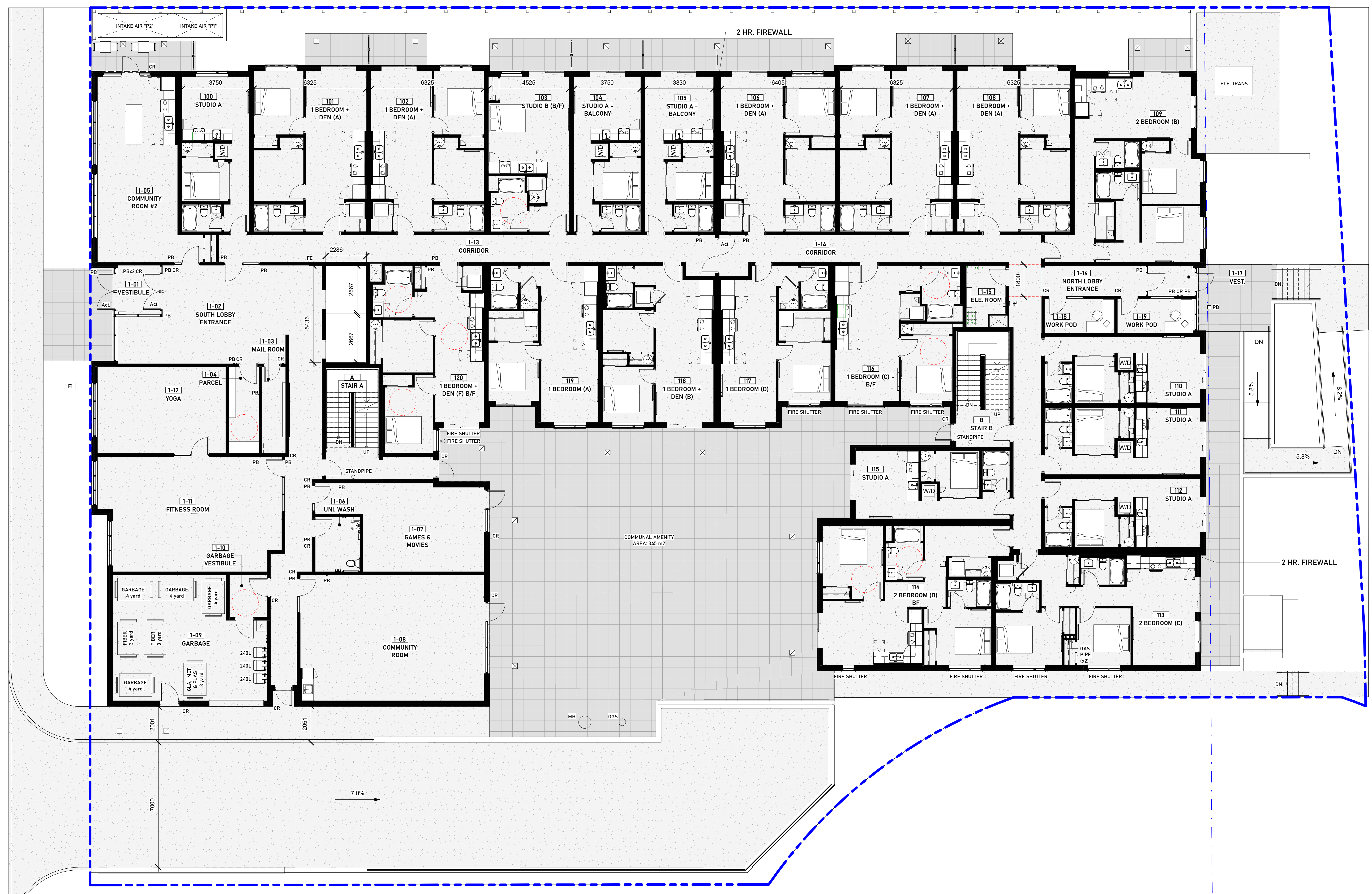
1 1st FLOOR LEVEL 1:100

Scale: 1:100 Drawn By: JV Checked By: JB Date: 2026-05-05 10:31:34 AM Sheet No. A2-1