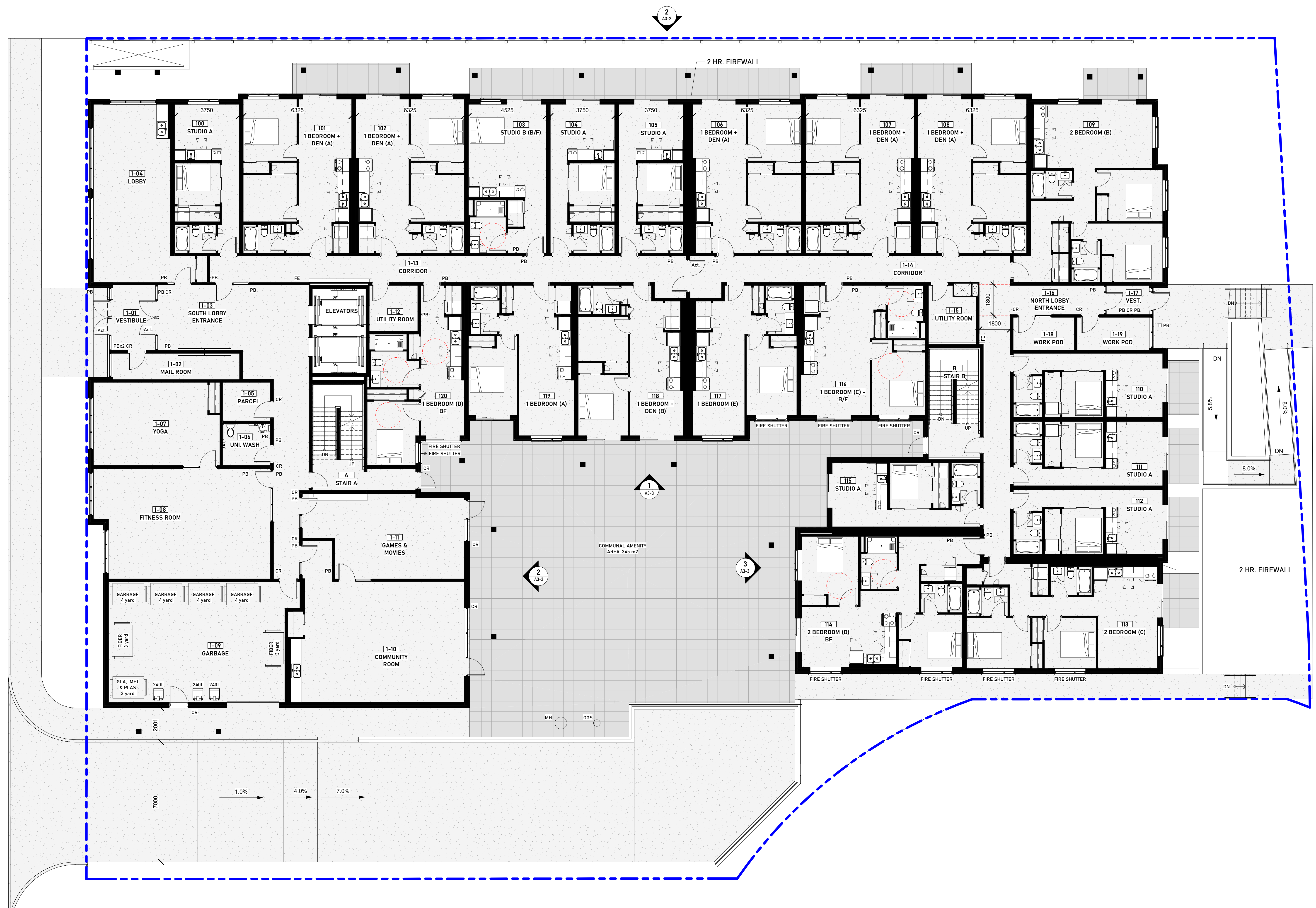
1 1st FLOOR LEVEL 1:100