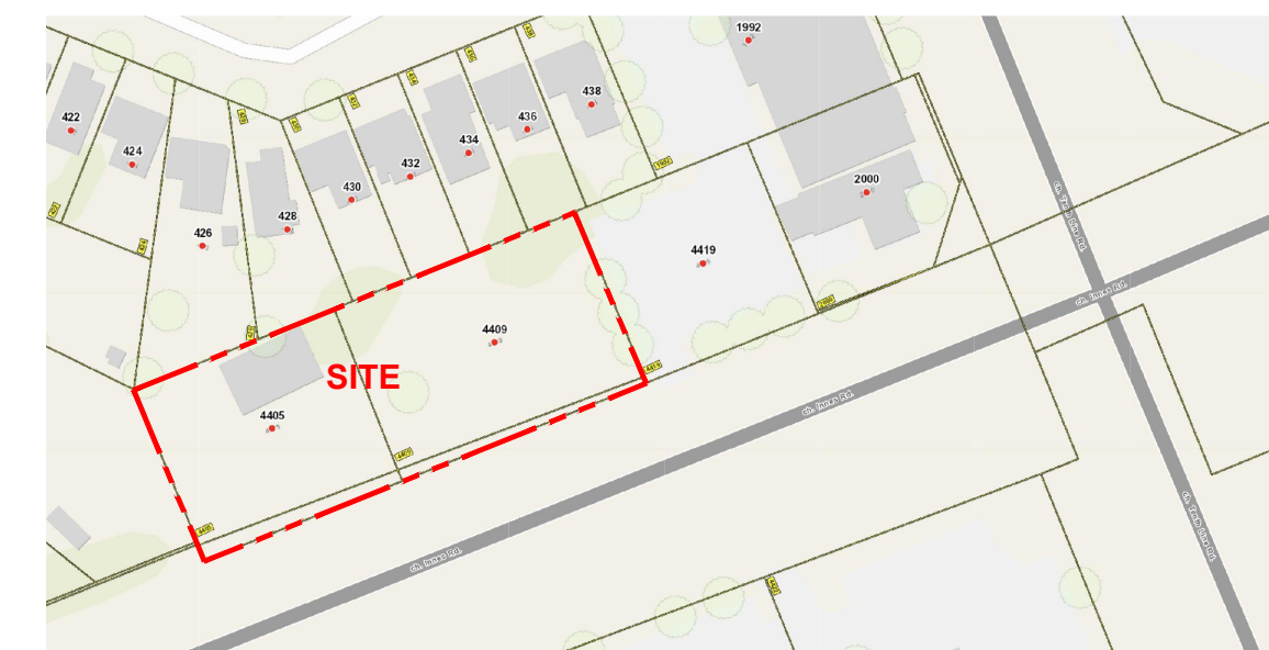
KEY PLAN: NTS