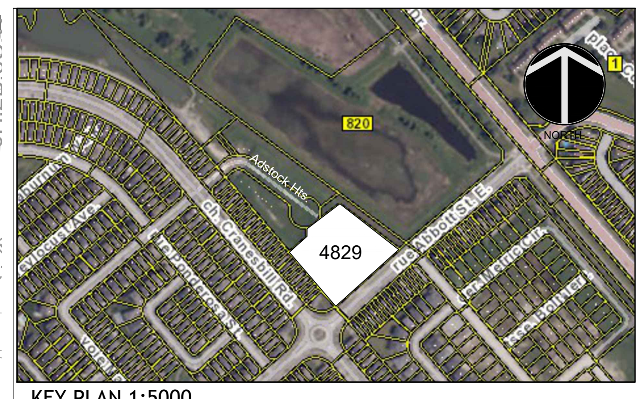
KEY PLAN 1:5000