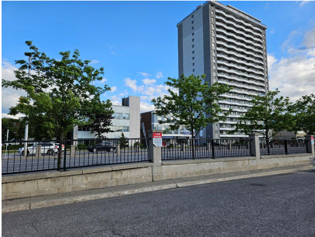
Trees 1 – 3