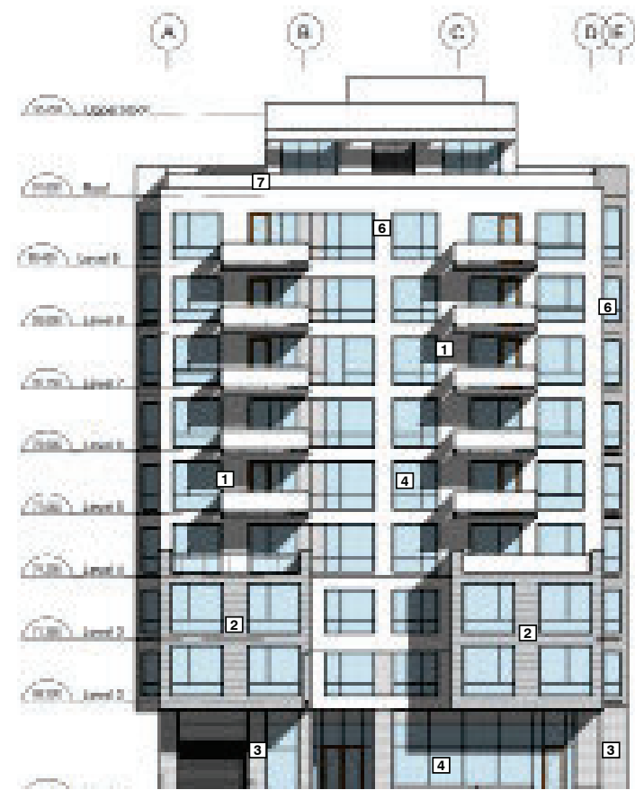
West Elevation (Front Facade)