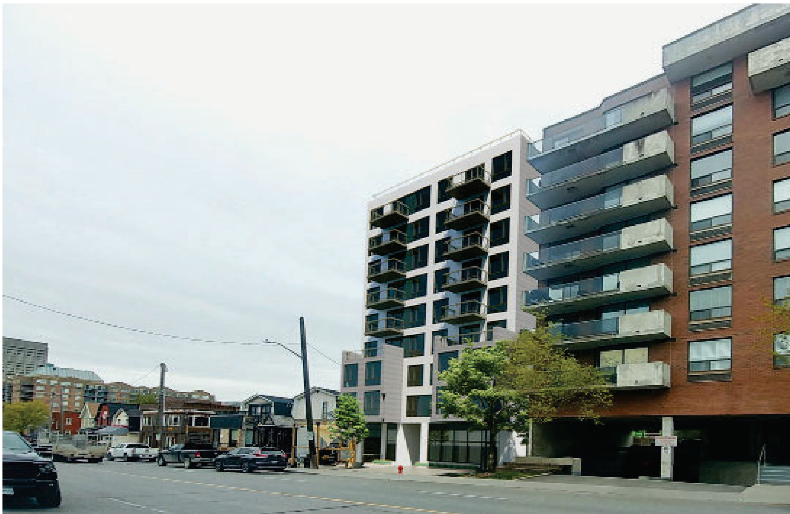
.7 BUILDING PERSPECTIVE - OBLIQUE VIEW FACING NORTH -WEST

91-93 Holland Avenue | 03-04-2025 | City of Ottawa Design Brief