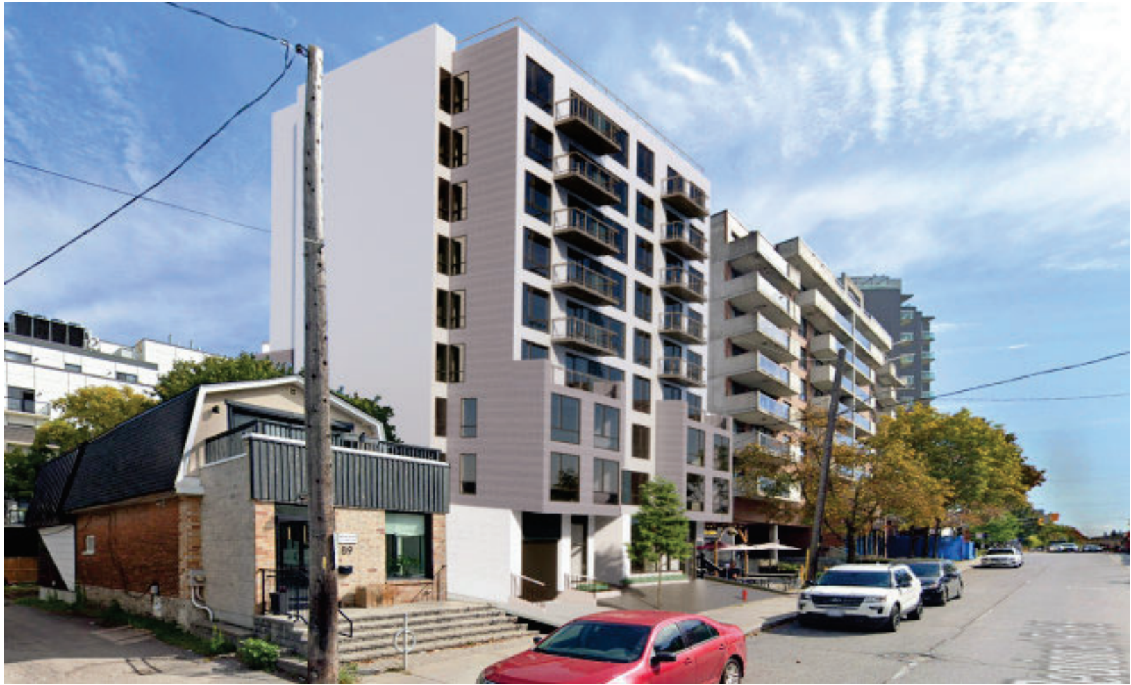
.6 BUILDING PERSPECTIVE - OBLIQUE VIEW FACING SOUTH-EAST

91-93 Holland Avenue | 03-04-2025 | City of Ottawa Design Brief