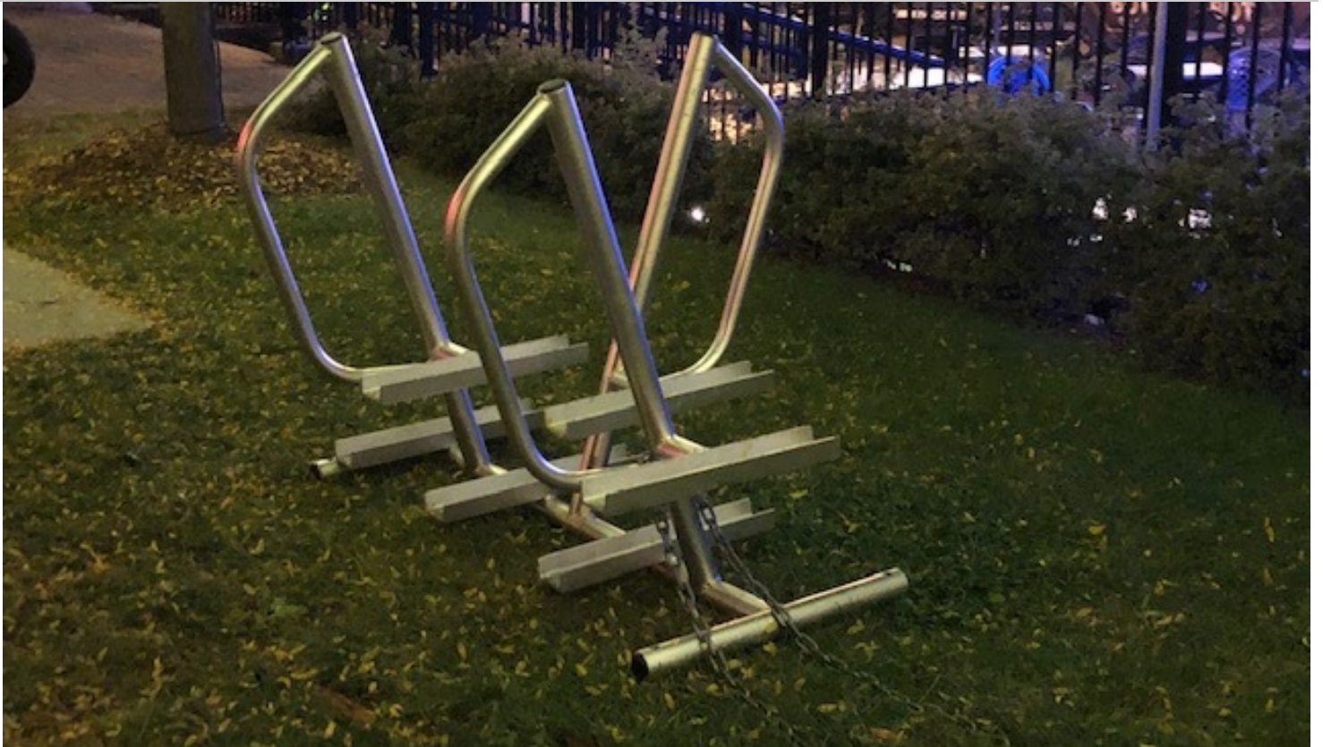
Lanark Ontario Canada Terms & Conditions / Privacy Policy