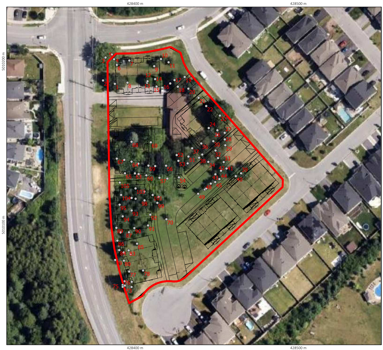
Figure 2 Tree Results Following Excavation