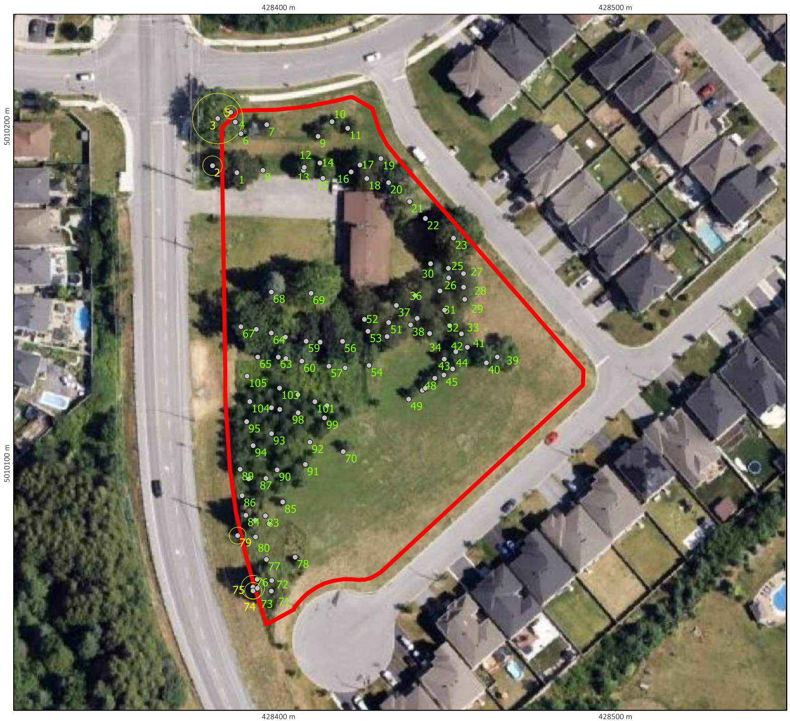
Figure 1 Tree Locations