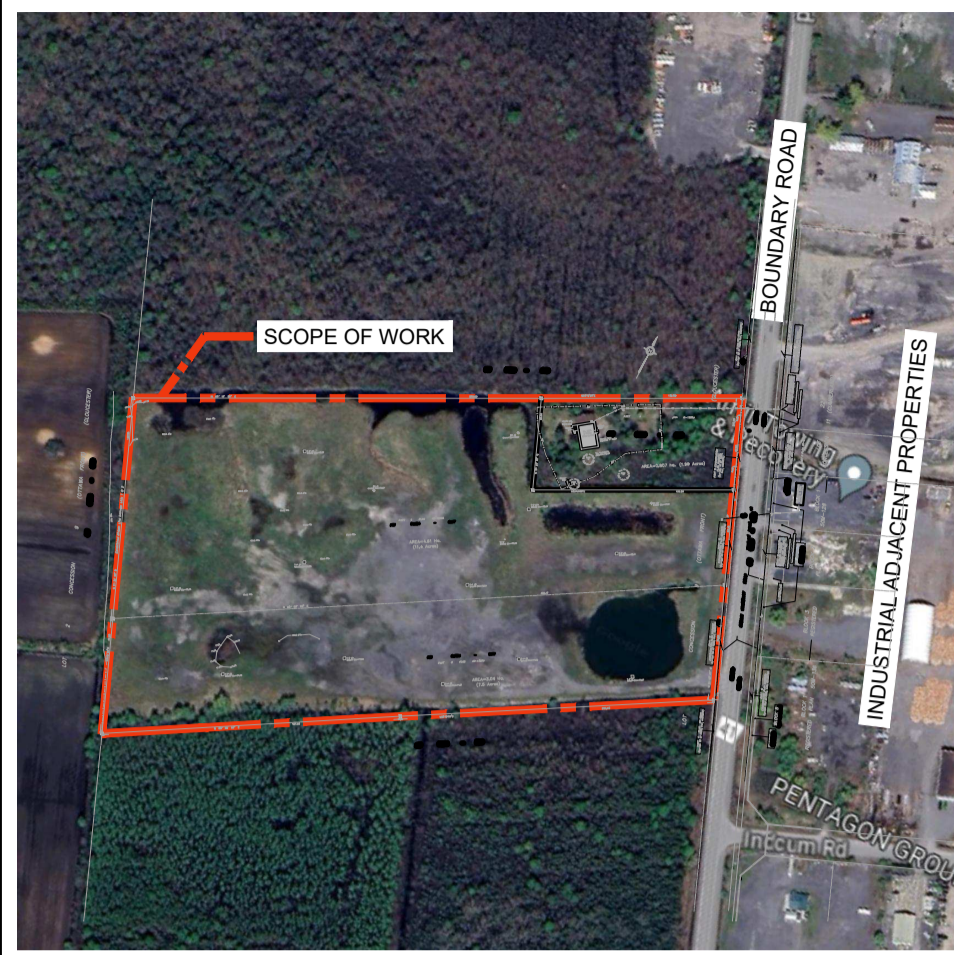
1 EXISTING KEY PLAN SCALE: N/A