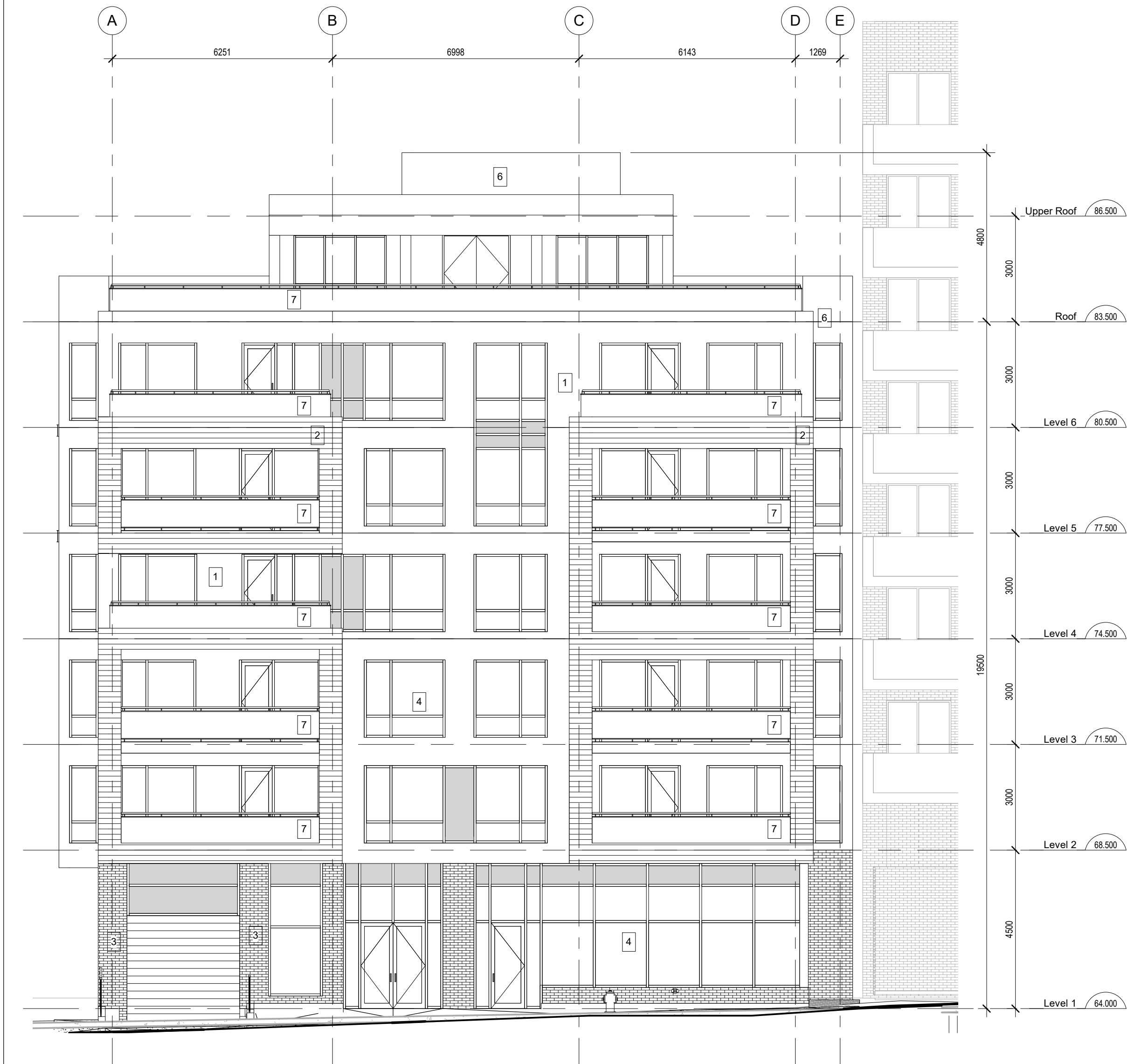
1 WEST ELEVATION A-200 SCALE 1 : 100

APPROVED By Andrew McCreight at 10:22 am, Nov 30, 2022