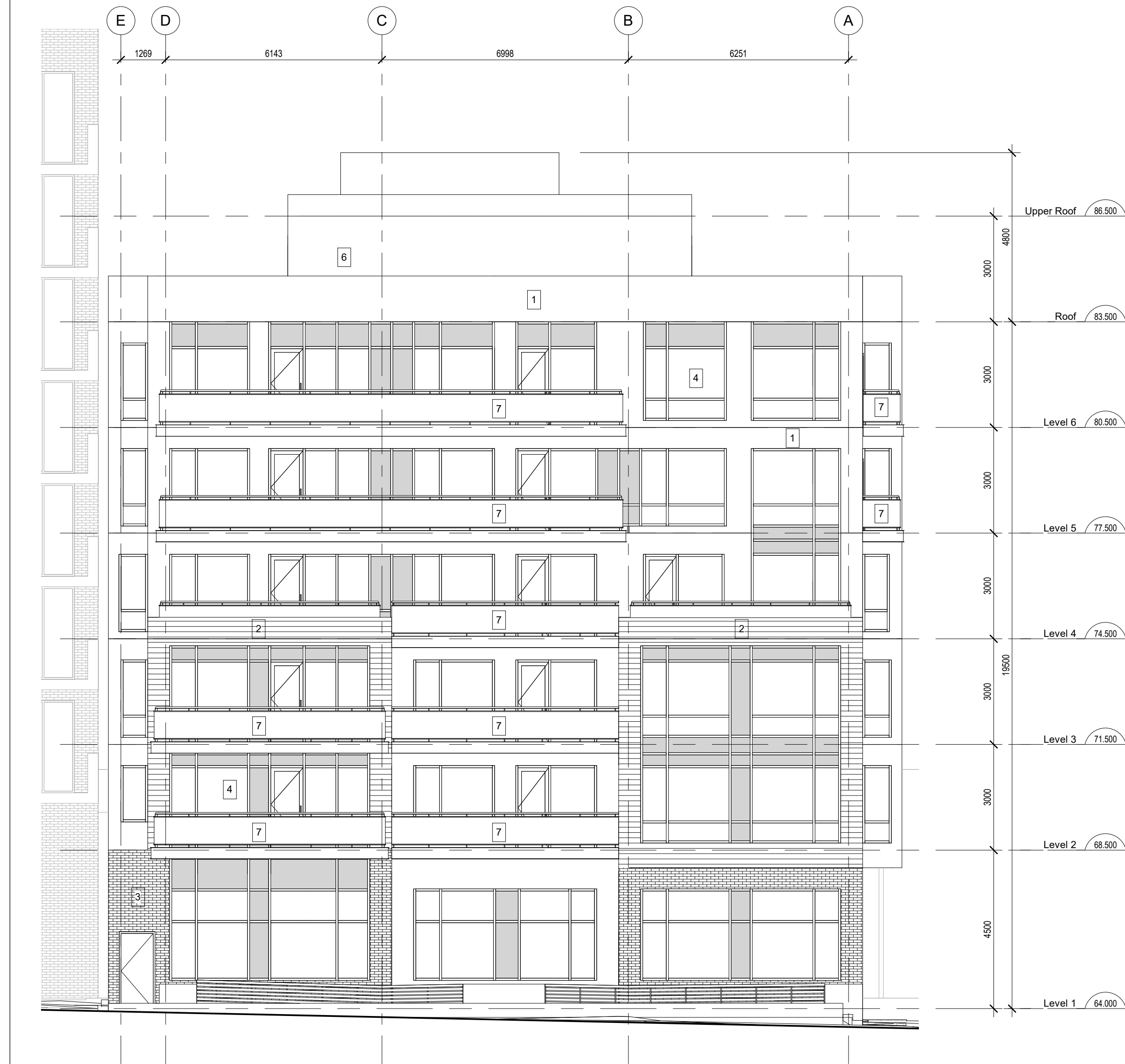
2 EAST ELEVATION A-200 SCALE 1 : 100

Andrew McCreight ANDREW MCCREIGHT MANAGER (A), DEVELOPMENT REVIEW CENTRAL PLANNING, REAL ESTATE & ECONOMIC DEVELOPMENT DEPARTMENT, CITY OF OTTAWA