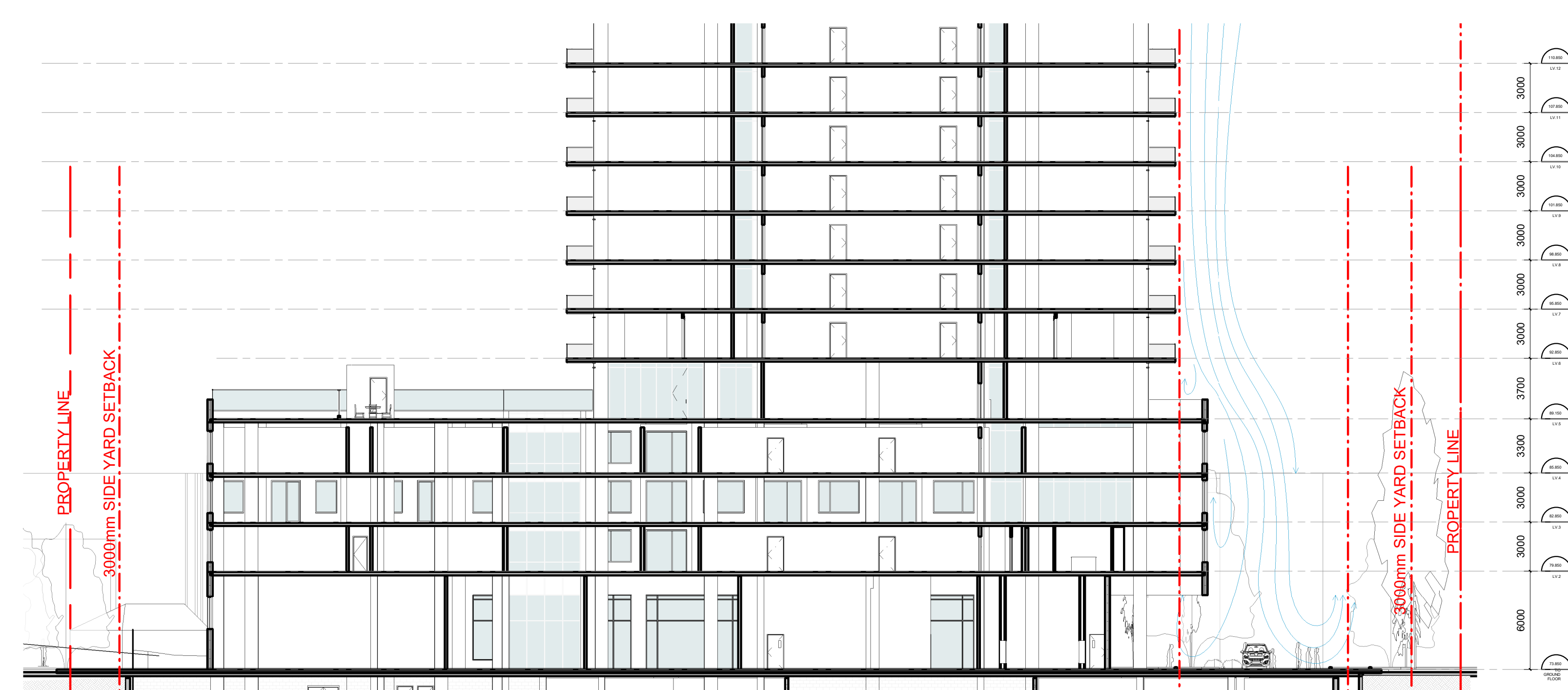
03: WIND SECTION DIAGRAM - PROPOSED DESIGN - ENCLOSED PROJECTION

IT IS THE RESPONSIBILITY OF THE APPROPRIATE CONTRACTOR TO CHECK AND VERIFY ALL DIMENSIONS ON SITE AND TO REPORT ALL ERRORS AND/OR OMISSIONS TO THE ARCHITECT. ALL CONTRACTORS MUST COMPLY WITH ALL PERTINENT CODES AND BY-LAWS. THIS DRAWING MAY NOT BE USED FOR CONSTRUCTION UNTIL SIGNED BY THE ARCHITECT. DO NOT SCALE DRAWINGS. COPYRIGHT RESERVED.