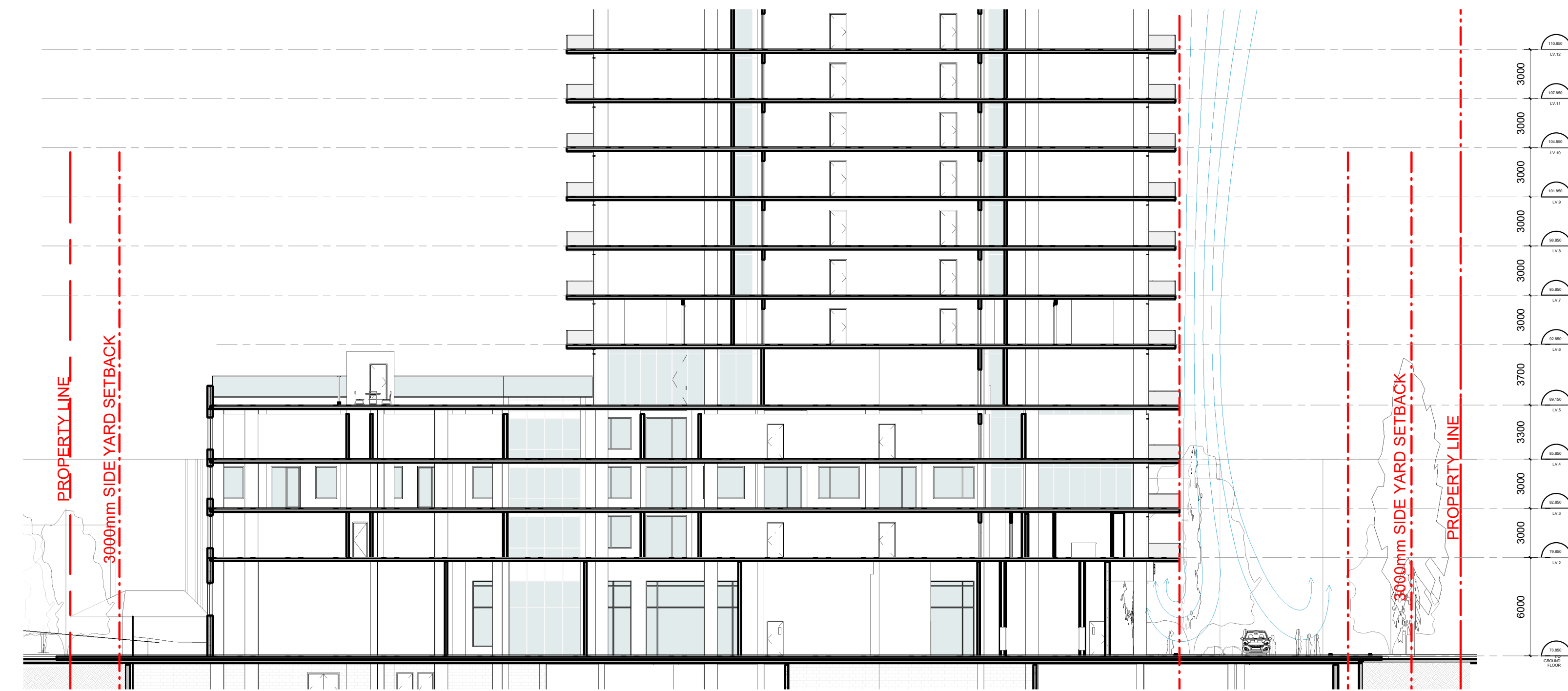
01: WIND SECTION DIAGRAM - CONCEPT DESIGN - NO PROJECTION

APPROVED By Sean Moore at 3:58 pm, May 25, 2026