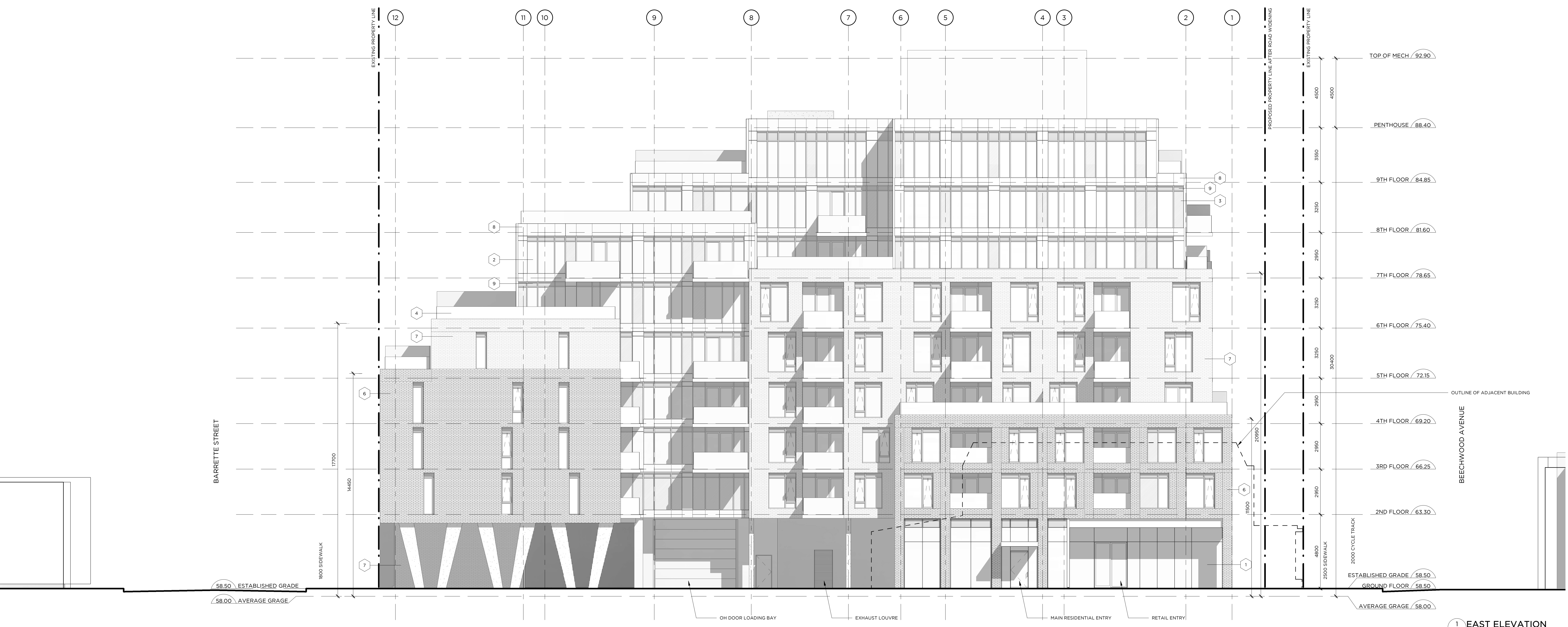
1 EAST ELEVATION A402 1:100