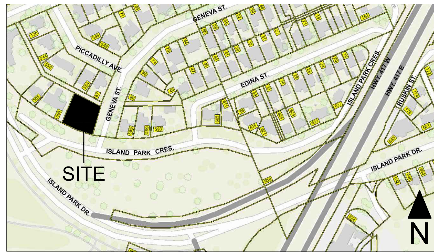
1 LOCATION MAP SCALE: N.T.S.