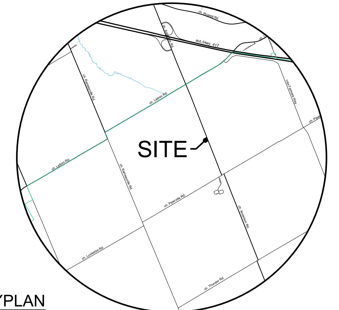
KEYPLAN NOT TO SCALE