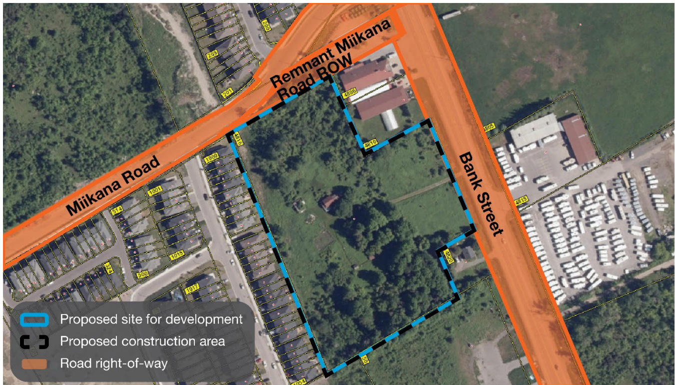
Figure 1: Proposed Construction Diagram

Discussions are ongoing with City staff regarding the use of the remnant Miikana Road right-of-way. Access to the subject property is proposed from the Miikana Road right of way. The location of construction within either the Bank Street or Miikana Road right of way is still to be determined based on the ongoing discussions with City staff.