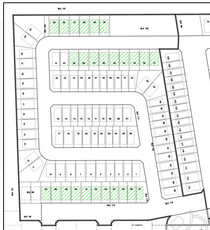
Figure 1 - Frozen Lot (Green Hatch)

Caivan retained DSEL to prepare a servicing allocation rationale in support of the lifting of the holding provision on 26 lot of their development in Fox Run Phase 5. See Figure 1 illustrating which lots are being held. The holding provision was established to ensure that development did not exceed the available water supply. The following was prepared to confirm that capacity exists to support the lifting of the holding provision for Fox Run Phase 5.