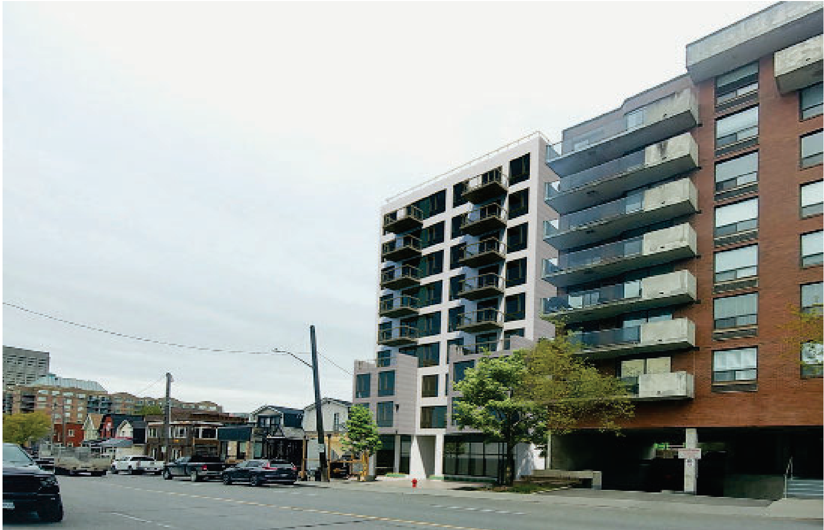
.7 BUILDING PERSPECTIVE - OBLIQUE VIEW FACING NORTH -WEST

91-93 Holland Avenue | 03-04-2025 | City of Ottawa Design Brief