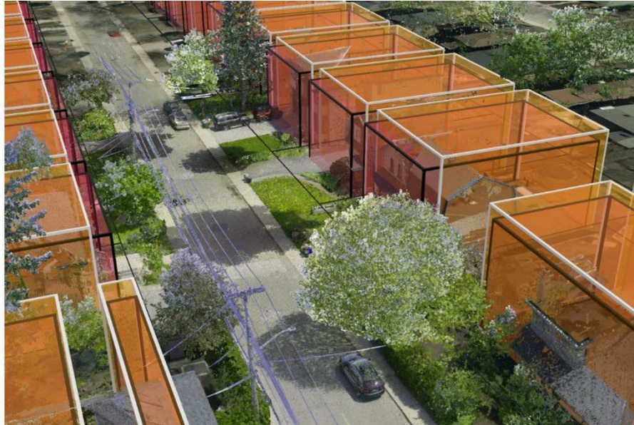
Figure - Comparison of existing and proposed zoning provisions for various N zones being shown by red and orange blocks.

The City's Digital Twin was used to model maximum building height and height transition provisions in three dimensions for N subzones using a mobile LiDAR scanner. The following are visual representation examples only.