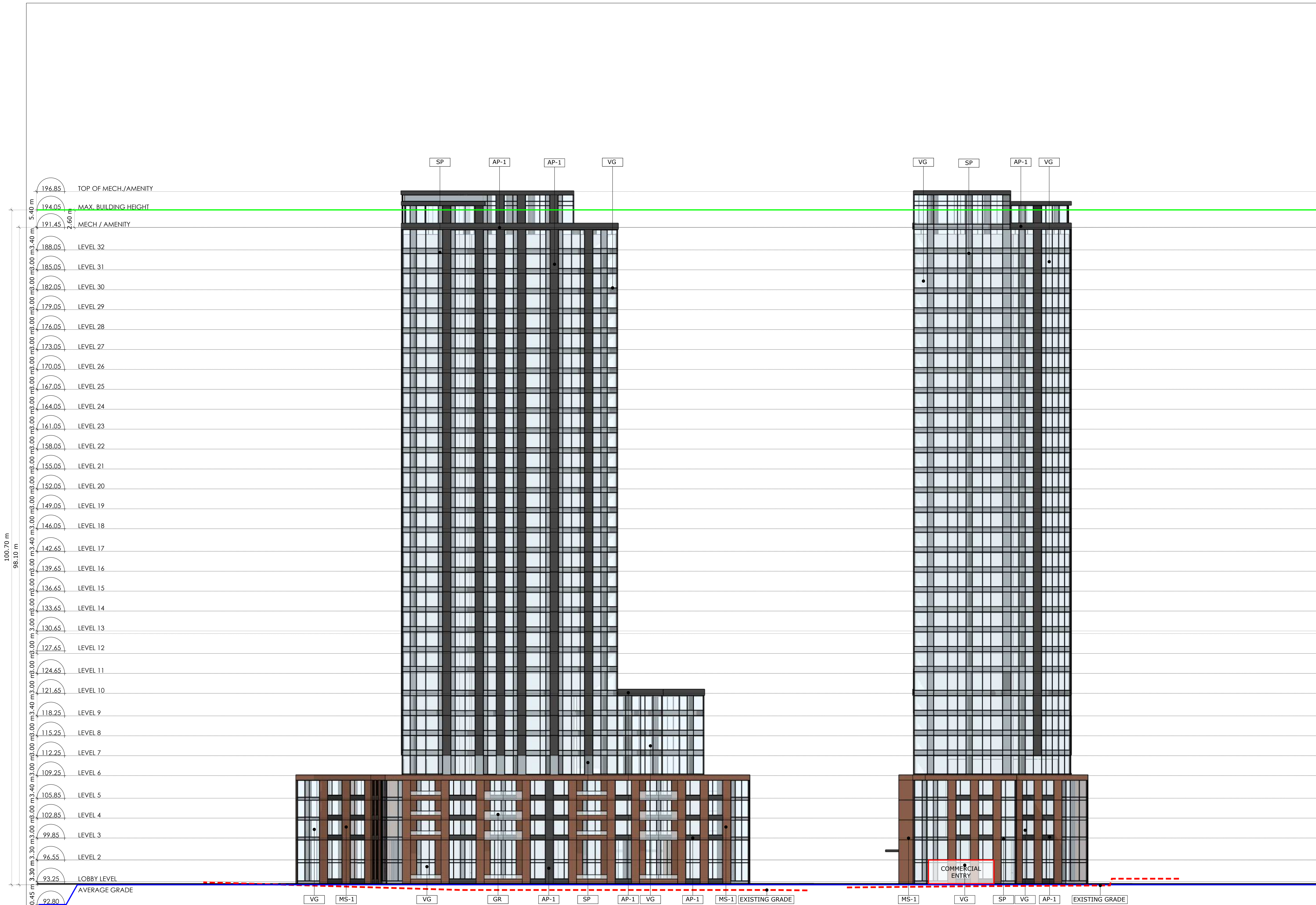
1 BUILDING 4 - NORTH ELEVATION A3.03 Scale: 1: 250