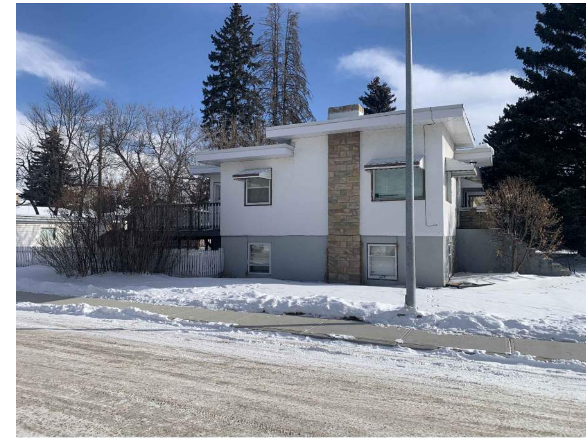
VIEW FROM SOUTH WEST