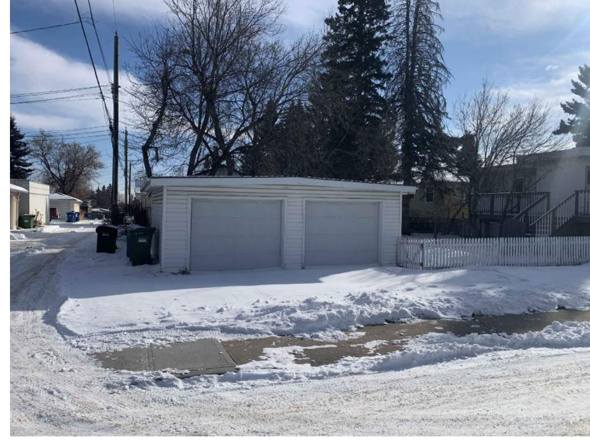
VIEW FROM NORTH WEST