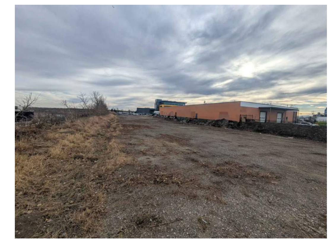
5 DP01 PHOTO - VIEW FROM THE N N/A