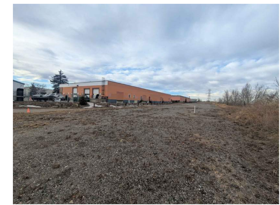
4 DP01 PHOTO - VIEW FROM THE SE N/A