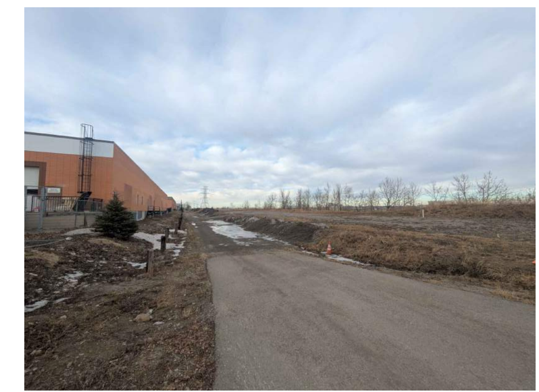
3 DP01 PHOTO - VIEW FROM THE SW N/A