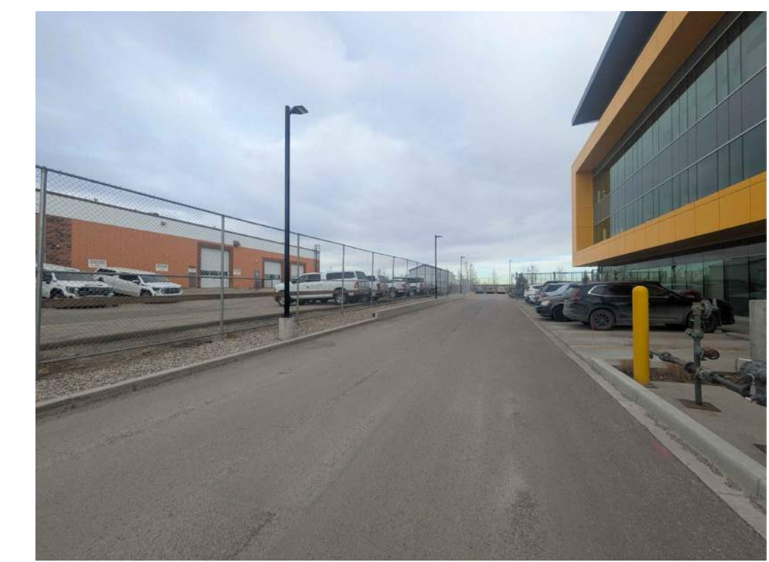
6 DP01 PHOTO - VIEW TOWARDS ENTRANCE FROM NE N/A