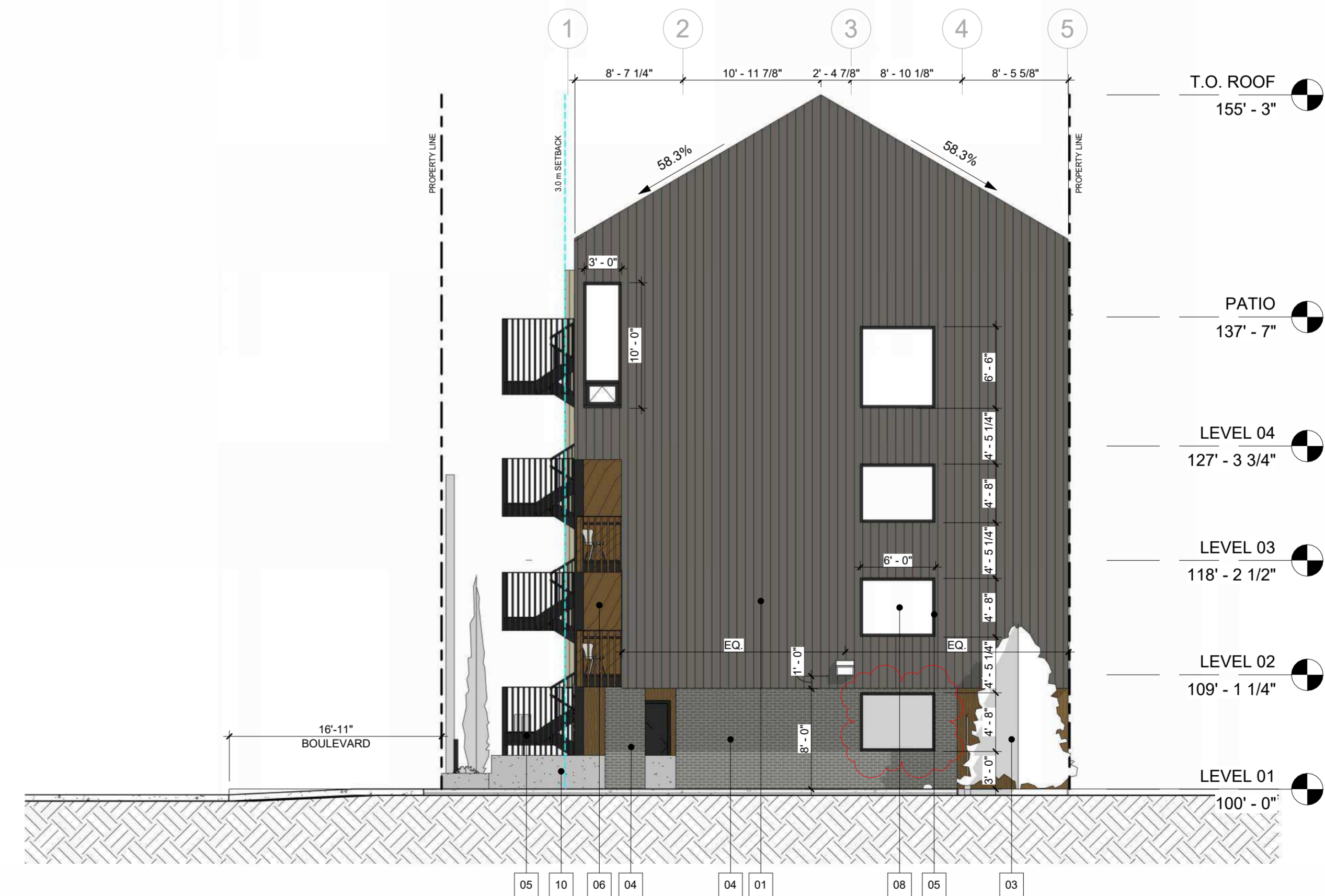
2 ELEVATION - SOUTH DP401 1/8" = 1'-0"