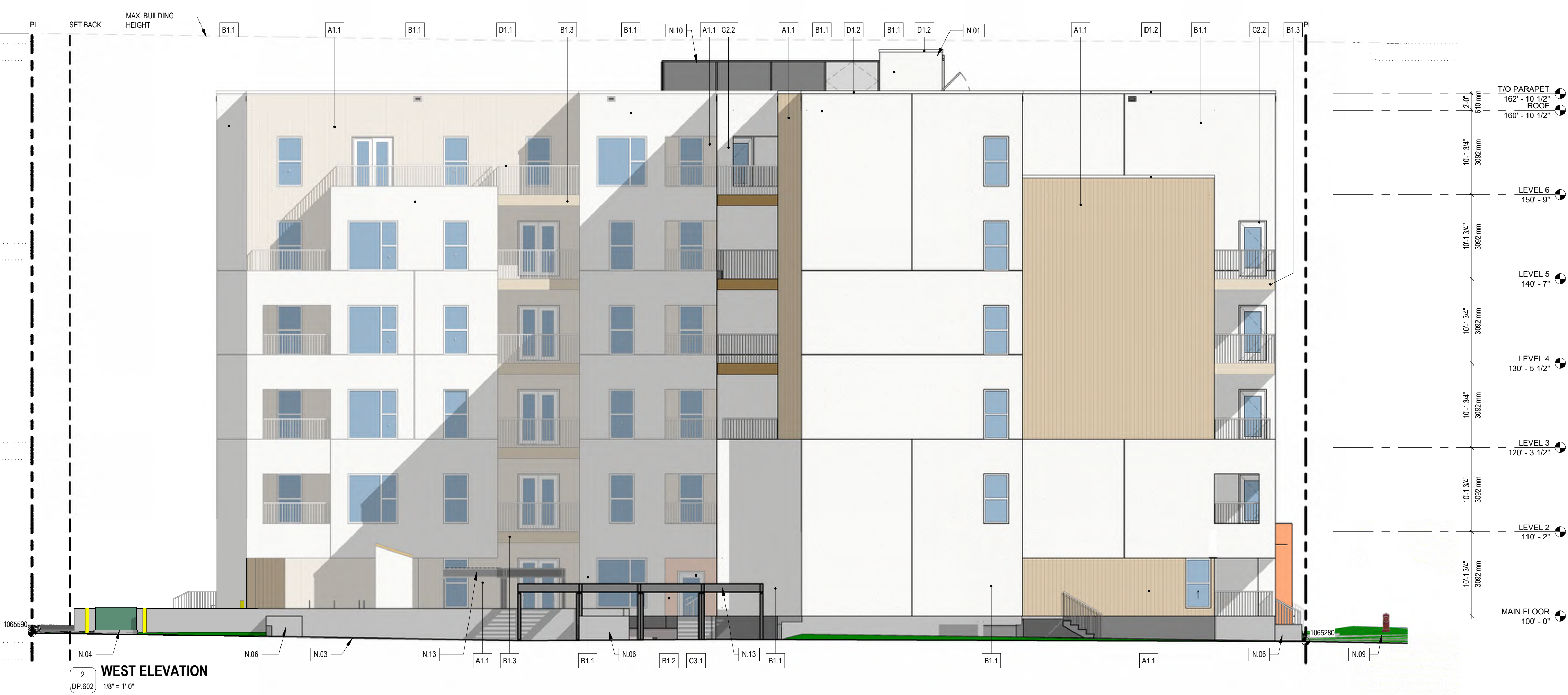
2 WEST ELEVATION 1/8" = 1'-0"