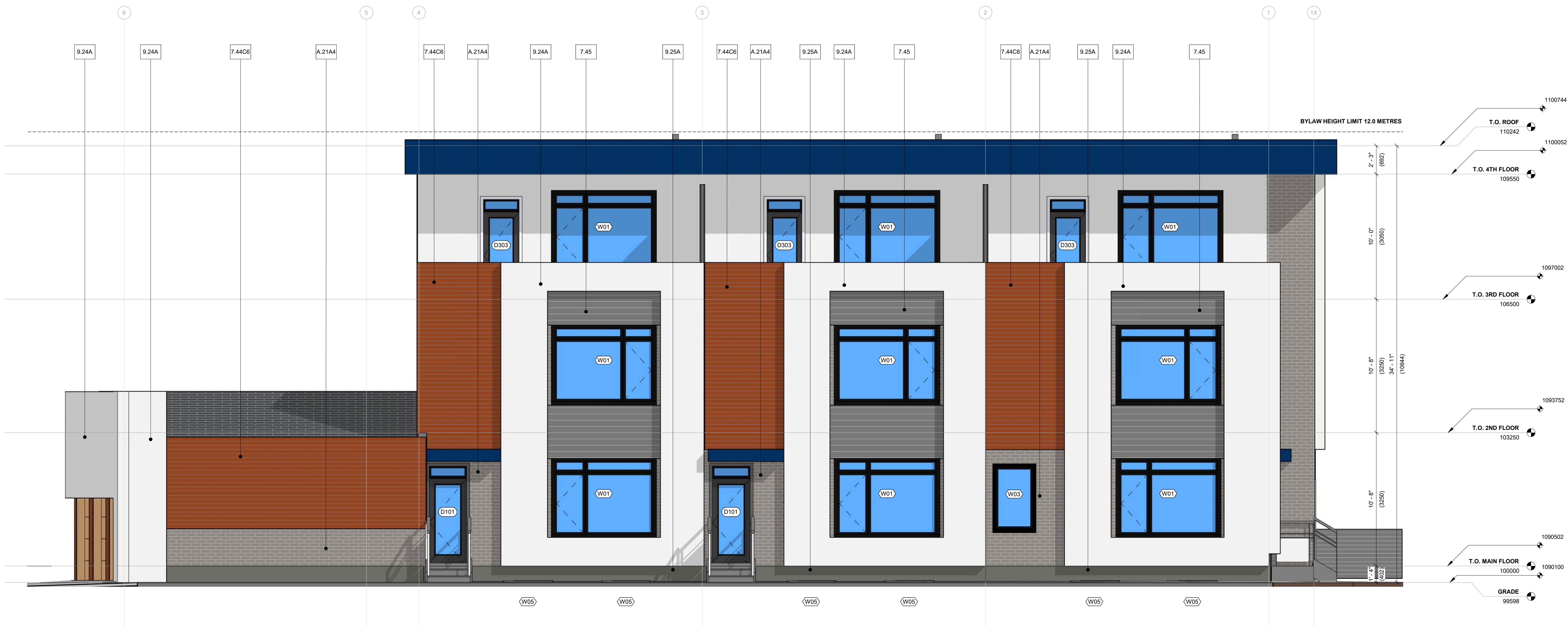
1 BUILDING ELEVATION - EAST A300 1 : 50