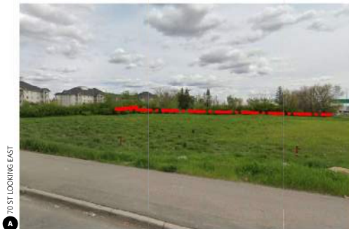
A 70 ST LOOKING EAST