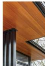
ALUMINUM SOFFIT COLOUR: WOOD LIKE (TBD)