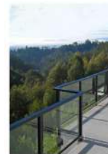
ALUMINUM/GLASS GUARD/RAILING COLOUR: BLACK