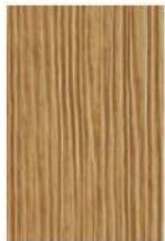
CEMENT BOARD LAP SIDING, COLOUR: 'SANDCASTLE' RUSTIC SERIES