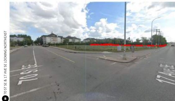
B 70 ST SE & 17 AVE SE LOOKING NORTHEAST