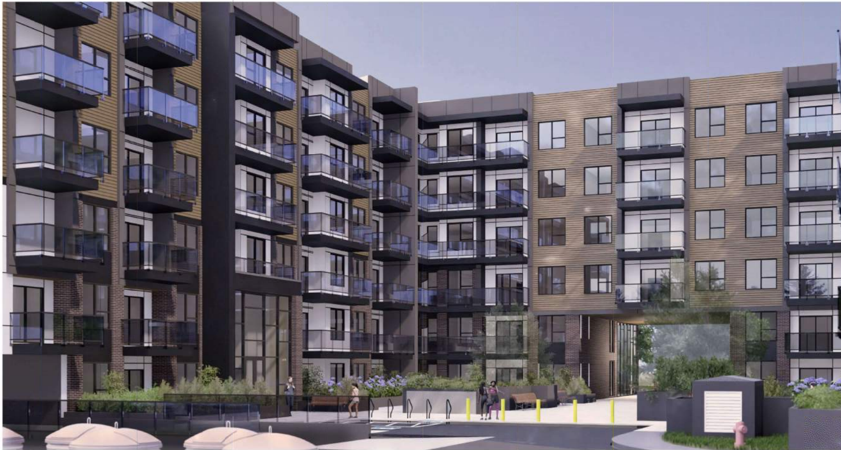
SOUTH EAST COURTYARD