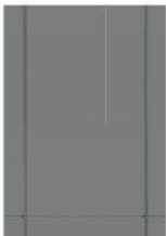
CEMENT BOARD PANEL SIDING COLOUR: NIGHT GRAY