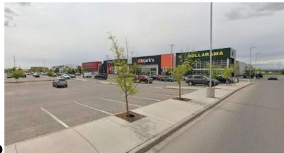
4 EAST HILLS SHOPPING CENTER