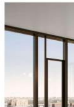
WINDOW COLOUR: BLACK EXT / WHITE INT