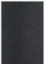
CEMENT BOARD PANEL SIDING, TEXTURED, COLOUR: 'BLACK MAGIC'