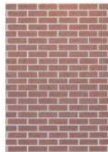
BRICK, TEXTURE: 'TEXTURED' COLOUR: 'GARNET' SM600 DARK BROWN GROUT