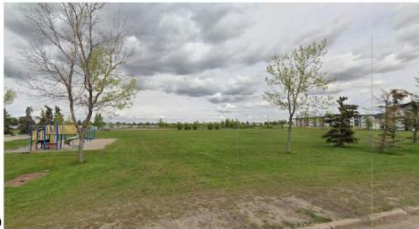
1 FORREST LAWN CRICKET GROUND

THE PROJECT SITE IS LOCATED ON THE WEST SIDE OF STONEY TRAIL ON 17TH AVENUE IN APPLEWOOD. THE SITE CONSISTS OF A SINGLE LOT THAT CURRENTLY HOUSES AN ABANDONED BUILDING PAD. THE SITE IS LOCATED AT THE VERY EAST END OF THE CITY, OFFERING QUICK ACCESS TO STONEY TRAIL AS WELL AS 17TH AVENUE. LOCATED NEXT TO THE LOT TO THE WEST IS A SMALL COMMERCIAL AREA AND THE ADJACENT LOT IS SET FOR COMMERCIAL DEVELOPMENT. THE SITE IS ALSO LOCATED IN CLOSE PROXIMITY TO THE EAST HILLS SHOPPING CENTRE AS WELL AS THE FORREST LAWN CRICKET GROUND AND APPLESTONE PARK WITHIN WALKING DISTANCE.