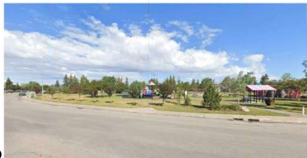
3 APPLESTONE PARK