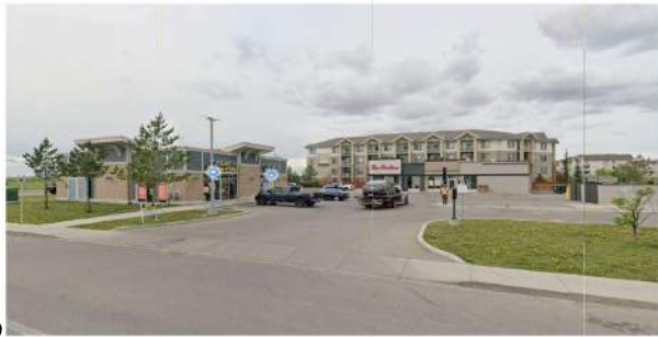
2 CORNER STORE AND COFFEE SHOP