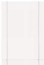
CEMENT BOARD BOARD SIDING COLOUR: 'ARCTIC WHITE'